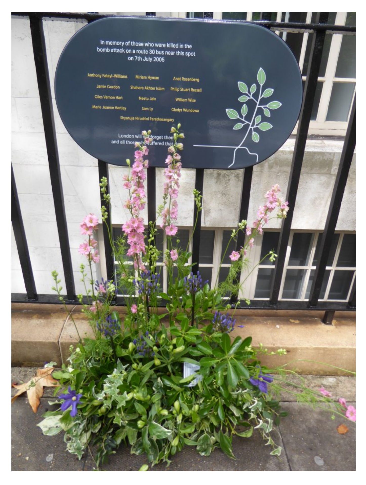
There is a memorial plaque on the railings similar to the three at each underground station but a more substantial stone