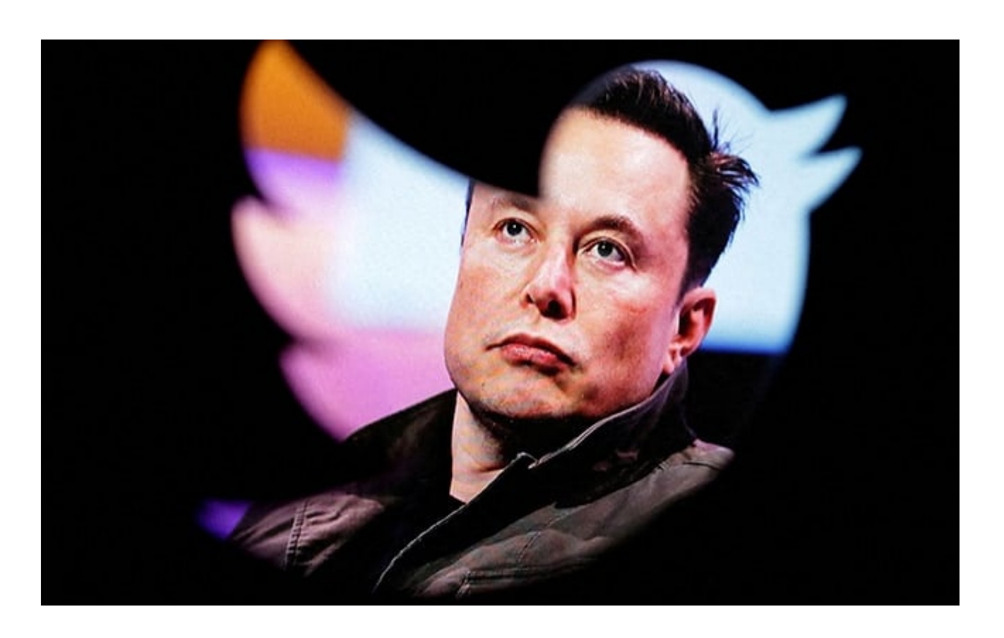
by Roger L. Simon

<u>Elon Musk</u> has released what should be called from now on "The <u>Twitter</u> Papers," far more ominous for our country than "The Pentagon Papers" of yore ever were.