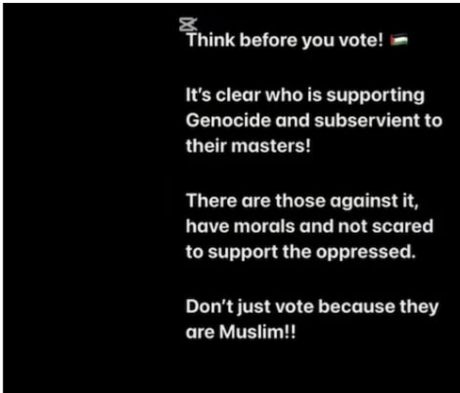
The video tells Wycombe voters to 'think before you vote'

At the start of the video, text that appears beside a Palestinian flag reads: "Think before you vote! It's clear who is supporting genocide and subservient to their masters. . . Don't sell your soul as Allah sees everything."