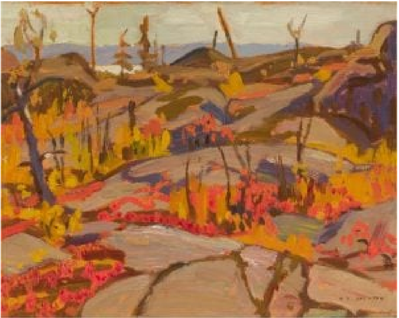
Wild Cherries and Huckleberries, Lake Superior , A. Y. Jackson, 1921

I'll be your huckleberry. –Doc Holiday to Johnny Ringo