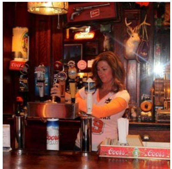
Fair maid flanked by jackalope

The barmaid must have mistaken my wonder for skepticism. As I paid for my lunch, she chirped; "It's not like it would be the first time anybody in this valley went home without their underpants."