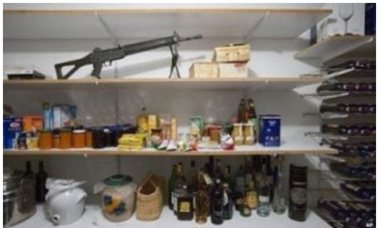
Swiss wine locker

If you are really worried about your child's behavior, maybe it's your family culture, stupid. Gratuitous violence is now as American as drug addiction and chlamydia. It's the actors, not the instruments, that need to be reformed.