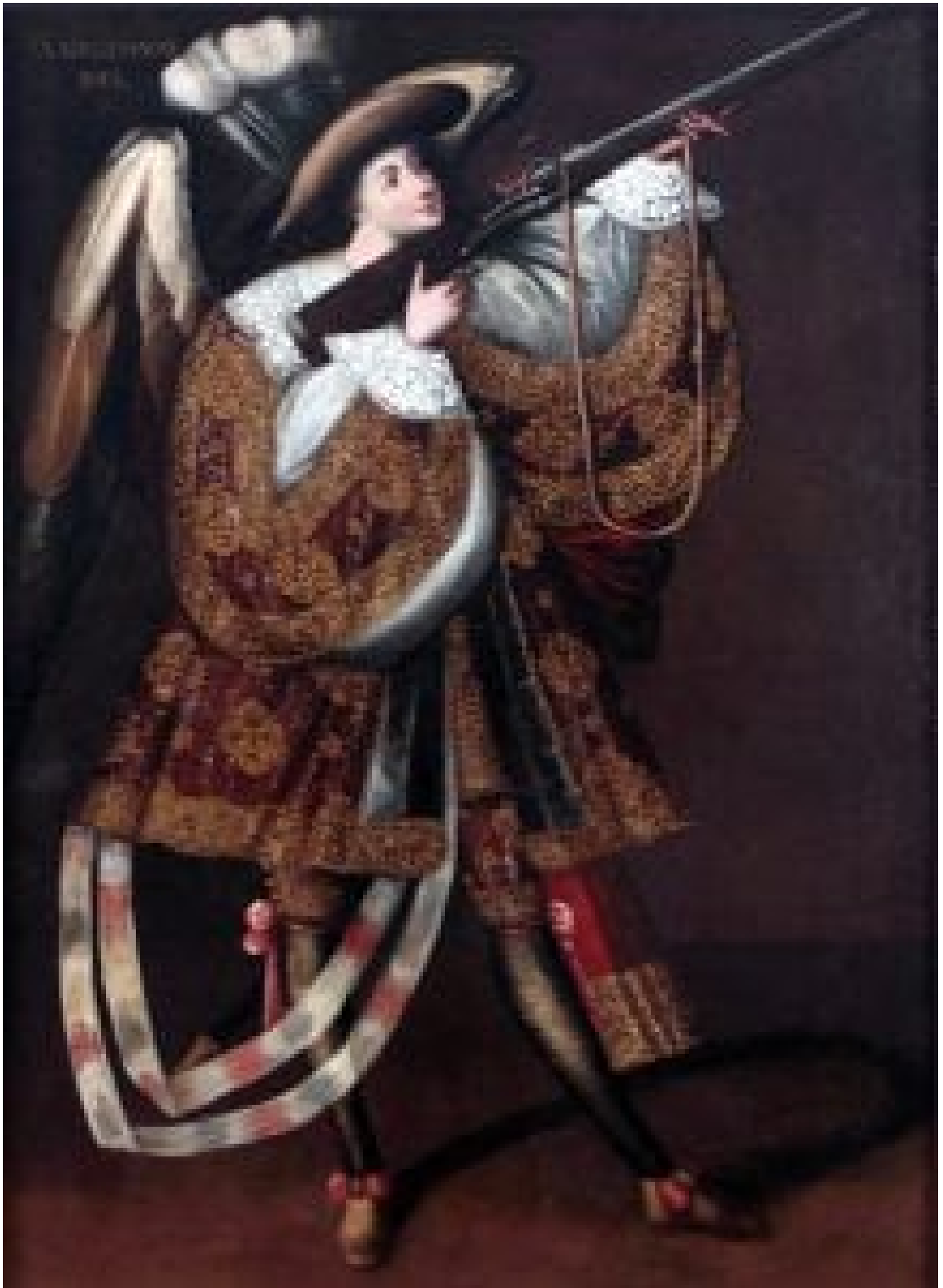
Archangel with Gun, Asiel Timor Dei, Master of Calamarca, before 1728