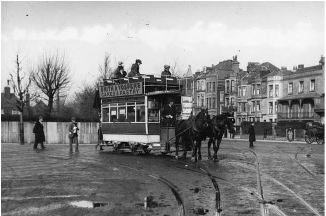
A horse-drawn tram at the King's Road Junction at Portsmouth,

But let us briefly return once more to the joys of Southsea before the advent of the motor car. In the same book is a picture of the promenade as it was in Conan Doyle's day, the only vehicle in the road a tram. The promenade had elegance and grandeur without inhumanity of scale; it was civilised without egotistical claims on the part of those who built it to artistic originality or genius. There was not much to do there, I imagine, except promenade and socialise in a somewhat restrained way, with occasional visits to the music hall and trips to the pier. Sensation, if it was wanted, was provided by the yellow press and novels such as those written by Mrs Belloc Lowndes, the sister of the much more famous Hilaire; while pornography titillated by its clandestinity rather than bored by its omnipresence.