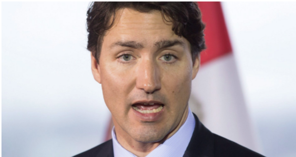
Homo Gnosticus Ebrius – Justin Trudeau

have neither experience nor instinct to tell us what he should be like. He is a mere extrapolation by some theorists of what a man would be if he were not bound by damnable human nature. He would be Homo Gnosticus. Never mind he is an homunculus.