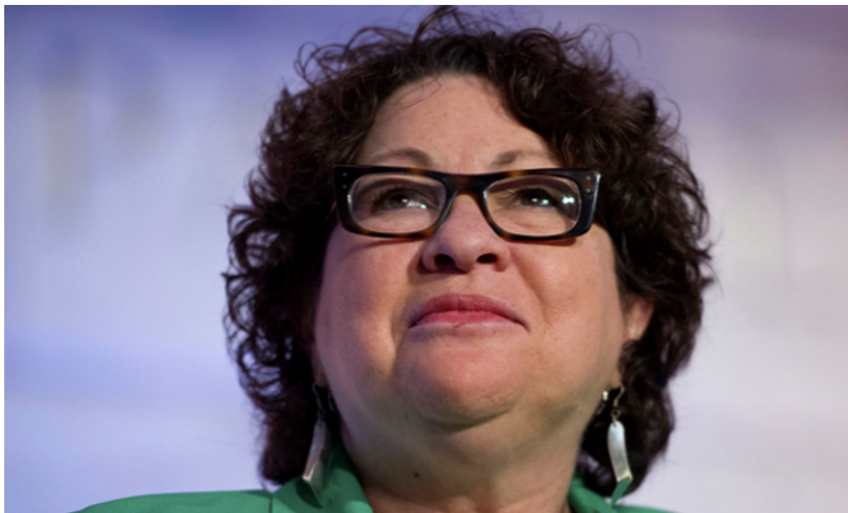
Homo Gnosticus Insapient – Sonia Sotomayor

For however many millennia Gnostics chewed and clawed, tooth and nail for a foothold in God's creation, it had never taken hold. St Augustine had long been beguiled by the ancient notion, in his time relevant as Manichaeism – until his mother's prayers were answered. Now, after millennia of futility, gnostics hold the high ground; crazy abounds; the world is nearer an asylum than a global union. There is so much of crazy about one fully expects they will run out crazy – that soon there will be no more crazy to be had. But how the hell does one sell crazy?