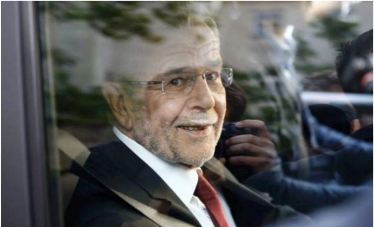
Homo Gnosticus Demens – Alexander van der Bellen