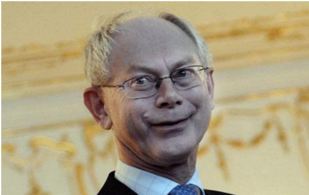
Homo Gnosticus Stultus – Herman von Rumpuy