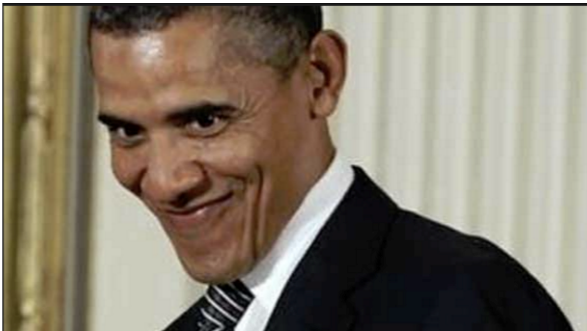
Homo Gnosticus Praevaricator – Barack Hussein Soetoro Obama

‘Progressivism’ is, beyond doubt, a pretense – as is made obvious by judging ALL of over a century’s applications of social, cultural, and political progress and results to date. Thereby provisioned with all that is requisite to draw the incontrovertible conclusion, the conclusion is: the utter demolition of Western Civilization is under way and ahead of schedule. Demolitions are as likely to come in under budget as constructions over budget.