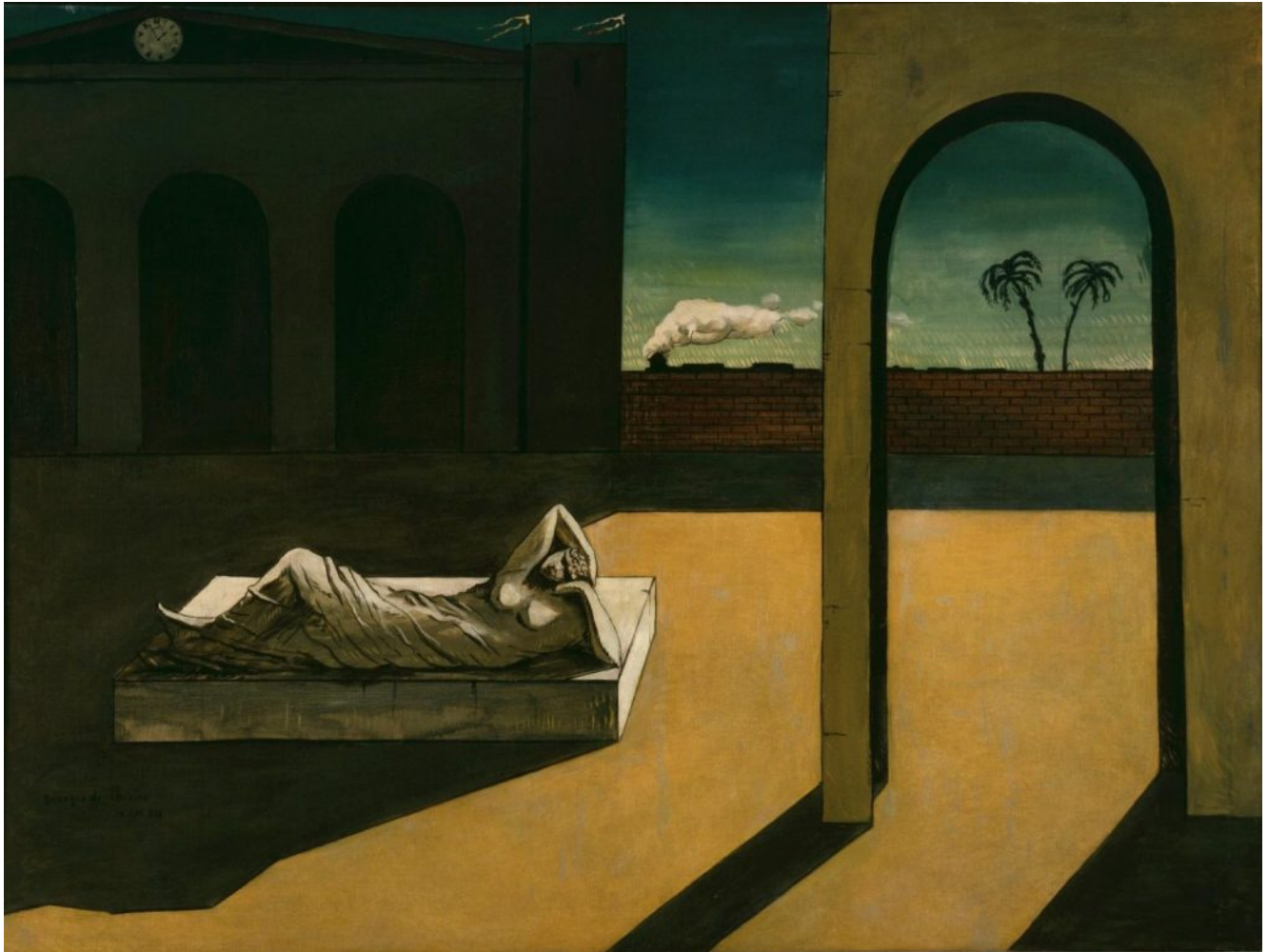
The Soothsayer's Recompense, Giorgio de Chirico (1913)

Meager checks on fraud ... were watered down to the point of meaninglessness. –Mollie Hemingway, Rigged