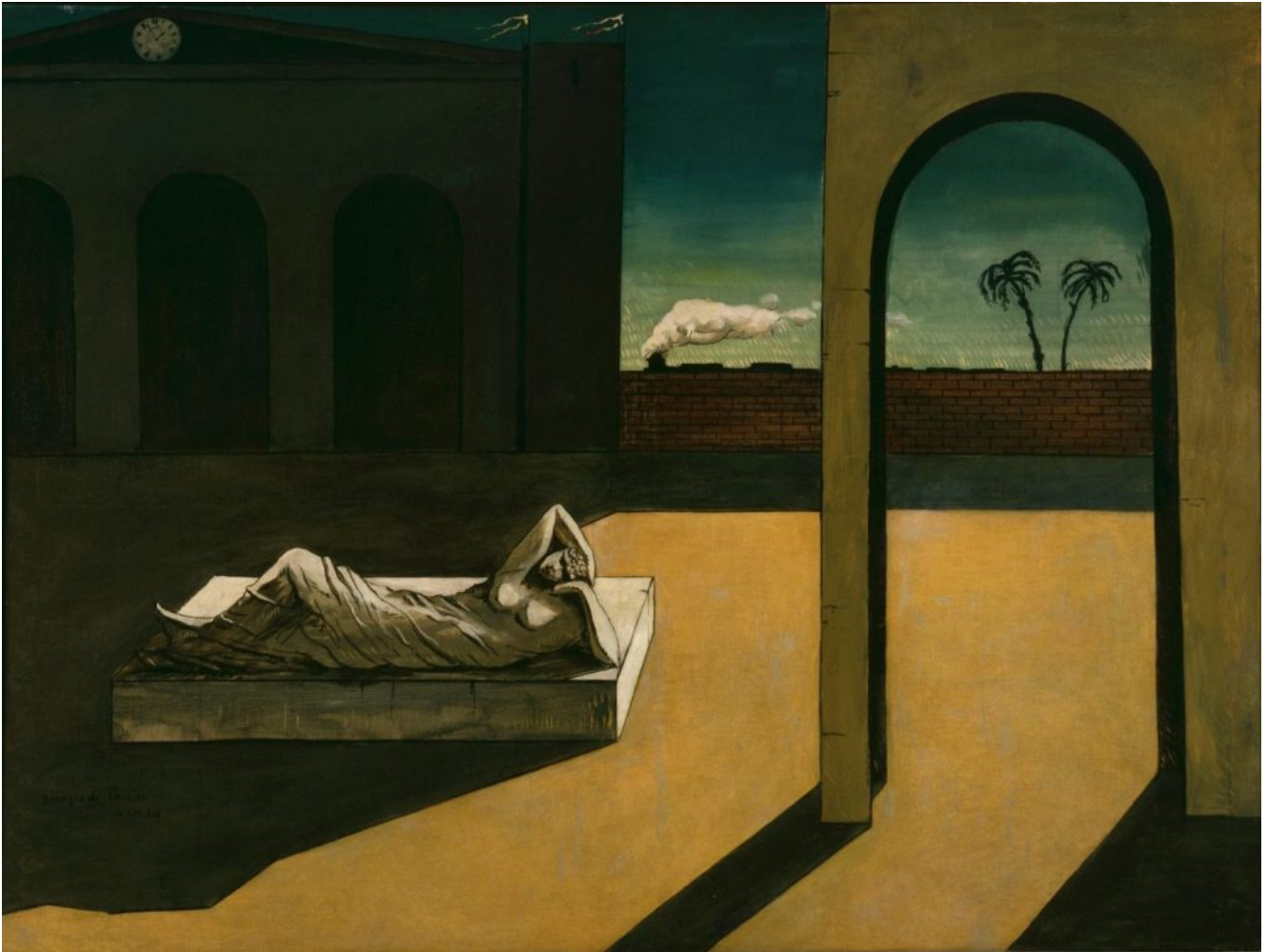
The Soothsayer's Recompense, Giorgio de Chirico (1913)

Meager checks on fraud ... were watered down to the point of meaninglessness. –Mollie Hemingway, Rigged