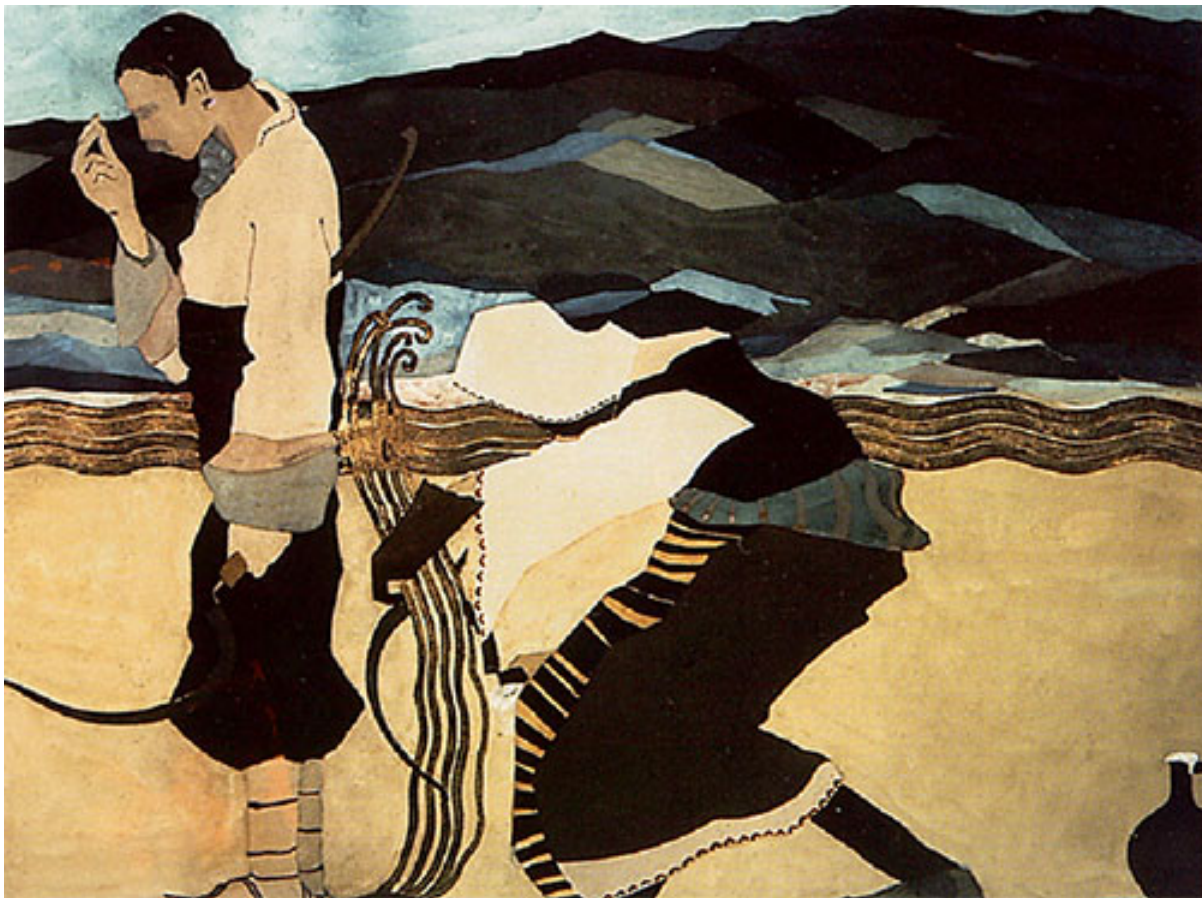
Evening Prayer of the Field , Ivan Milev, 1925