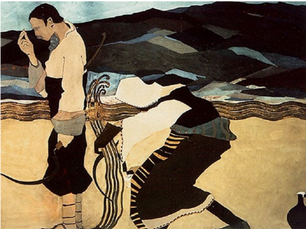
Evening Prayer of the Field , Ivan Milev, 1925