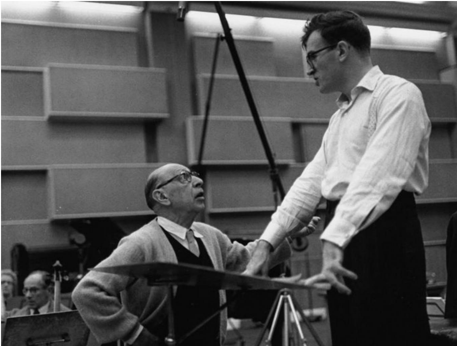
Igor Stravinsky and Robert Craft

To give an example of Craft's extraordinary service to Stravinsky, take that fascinating work from 1954, In Memoriam Dylan Thomas , a setting of Thomas's most famous poem, Do Not Go Gentle Into That Good Night , for string quartet, trombone quartet and tenor voice. After Thomas (a brief but intense acquaintance of the composer's) died, Craft, who had begun to share the composer's life several years earlier, suggested that Stravinsky set the poem to music. Craft read out loud Do Not Go Gentle with the composer (whose English was lively but unorthodox), no doubt emphasizing the poem's scansion, drawing attention to the plangent, quasi-musical echoes in its traditional villanelle form and elucidating its meaning. An enthusiast for pre-Bach music, Craft had introduced Stravinsky to the baroque composer Heinrich Schutz and his use of the trombone quartet as well as the musical forms of the dirge and the canon. A champion of the Second Viennese School and an acquaintance of Schoenberg as well, Craft explained to Stravinsky the Viennese composer's use of serialism, a systematic way of writing atonally that is loosely and idiosyncratically the basis for In Memoriam . Craft conducted