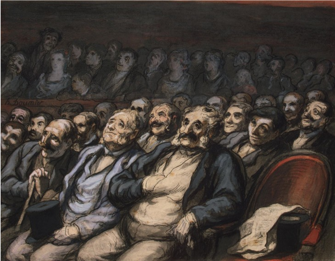
Orchestra Seat , Honoré Daumier, 1856-57

What are some of the ways we can be of use to an artist, particularly if that artist is a composer of note?