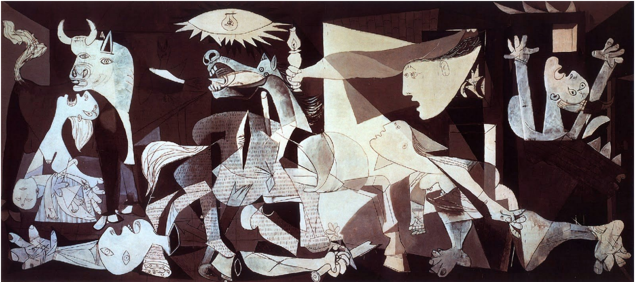
Guernica , Pablo Picasso, 1937

Russia is in the news a lot lately. From alleged interfering in American politics to hosting the World Cup, the Great Bear always fascinates both enemies and admirers. As for its literature: no other country's past is permeated more graphically with the themes of misery and war. And nowhere are such unimaginable horrors more prominent and terrifying than in the writings of Aleksandr Solzhenitsyn (1918-2008).