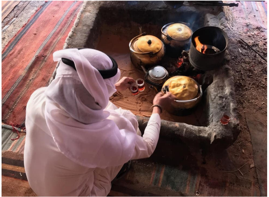
Bedouin Sinai 1990's

We were sitting around the campfire one evening, when one of my adopted Bedouin brothers so-called, was talking about their tribe and in Arabic. He said, "You know, there's no better tribe than us." I then realized that across the Middle East, there are Afghans, Pashtuns and Berbers saying, "there's no better tribe than us." That is different than the individualism of democracies.