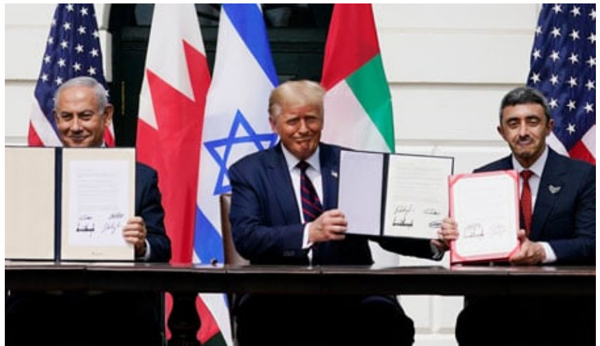
Signing the Abraham Accords