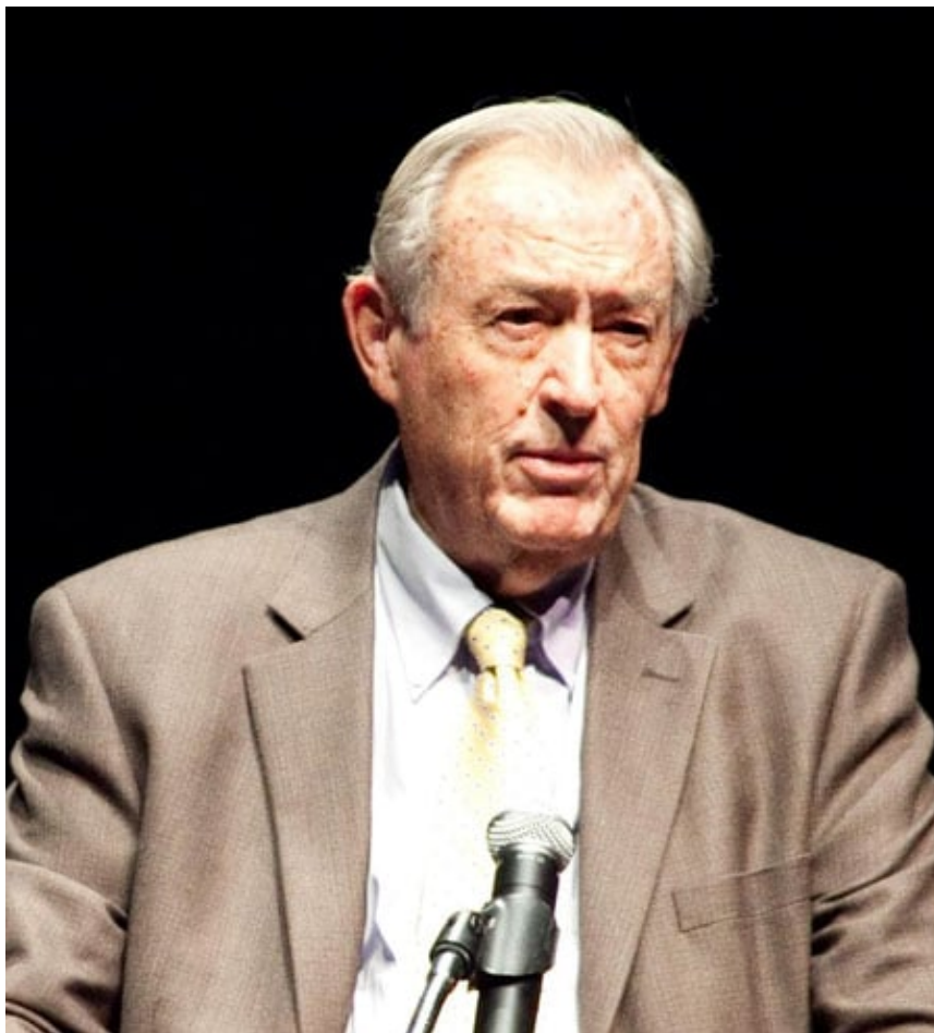
The late Richard Leakey, renowned Kenyan paleoanthropologist