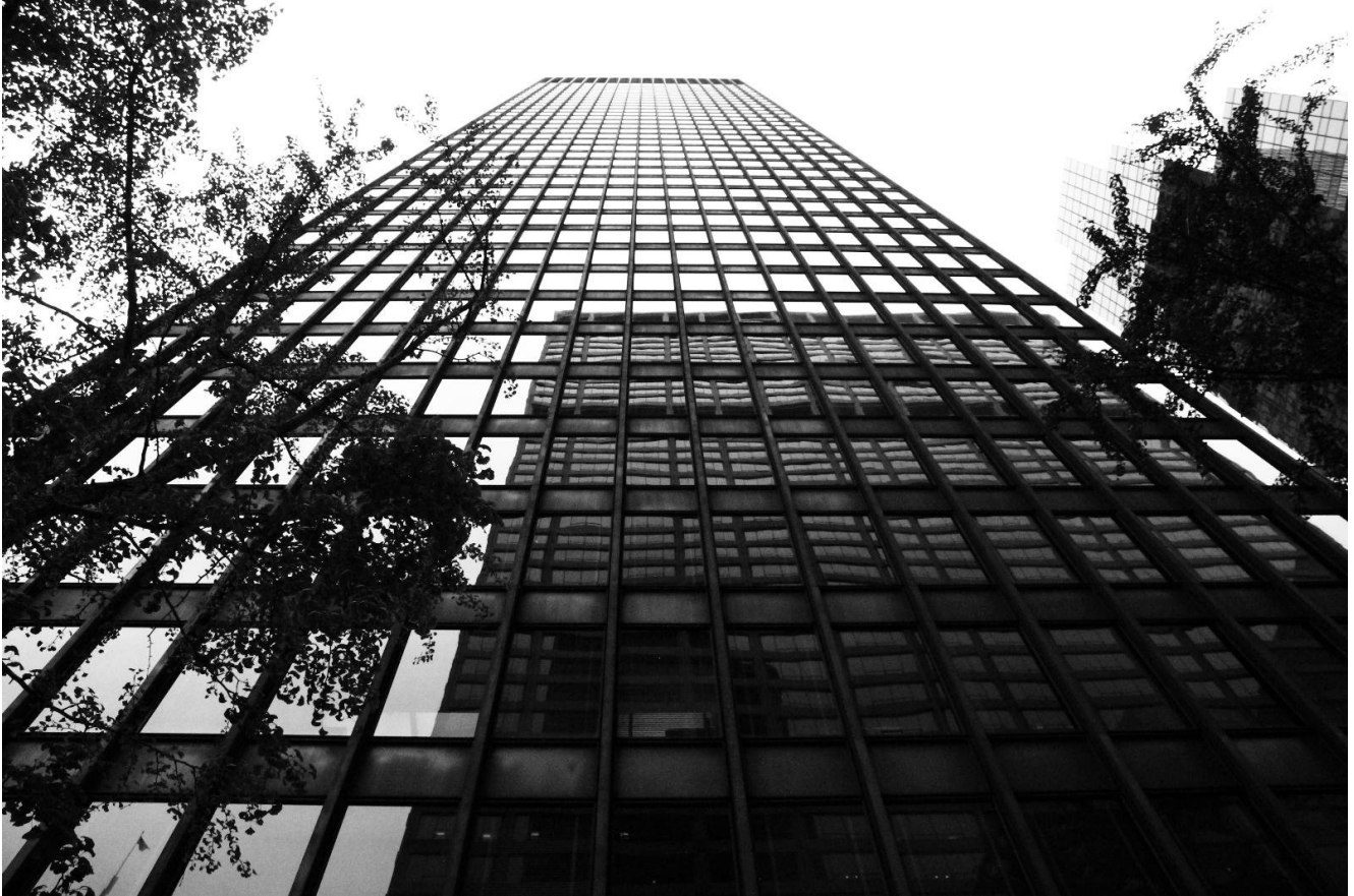
Seagram Building (Philip Johnson and Ludwig Mies van der Rohe), NYC

This review was originally published in The Jackdaw: Independent Views on the Visual Arts 147 (September/October 2019). It is reprinted here with permission.