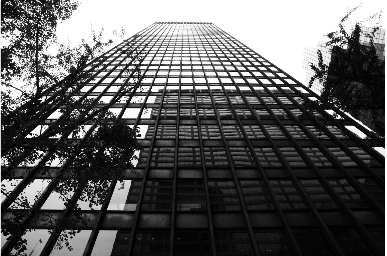
Seagram Building (Philip Johnson and Ludwig Mies van der Rohe), NYC

This review was originally published in The Jackdaw: Independent Views on the Visual Arts 147 (September/October 2019). It is reprinted here with permission.