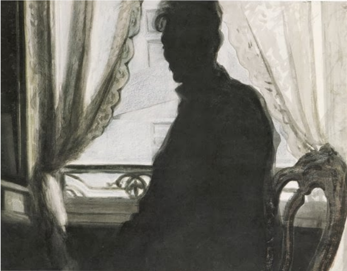
Silhouette du Peintre , Léon Spilliaert, 1907