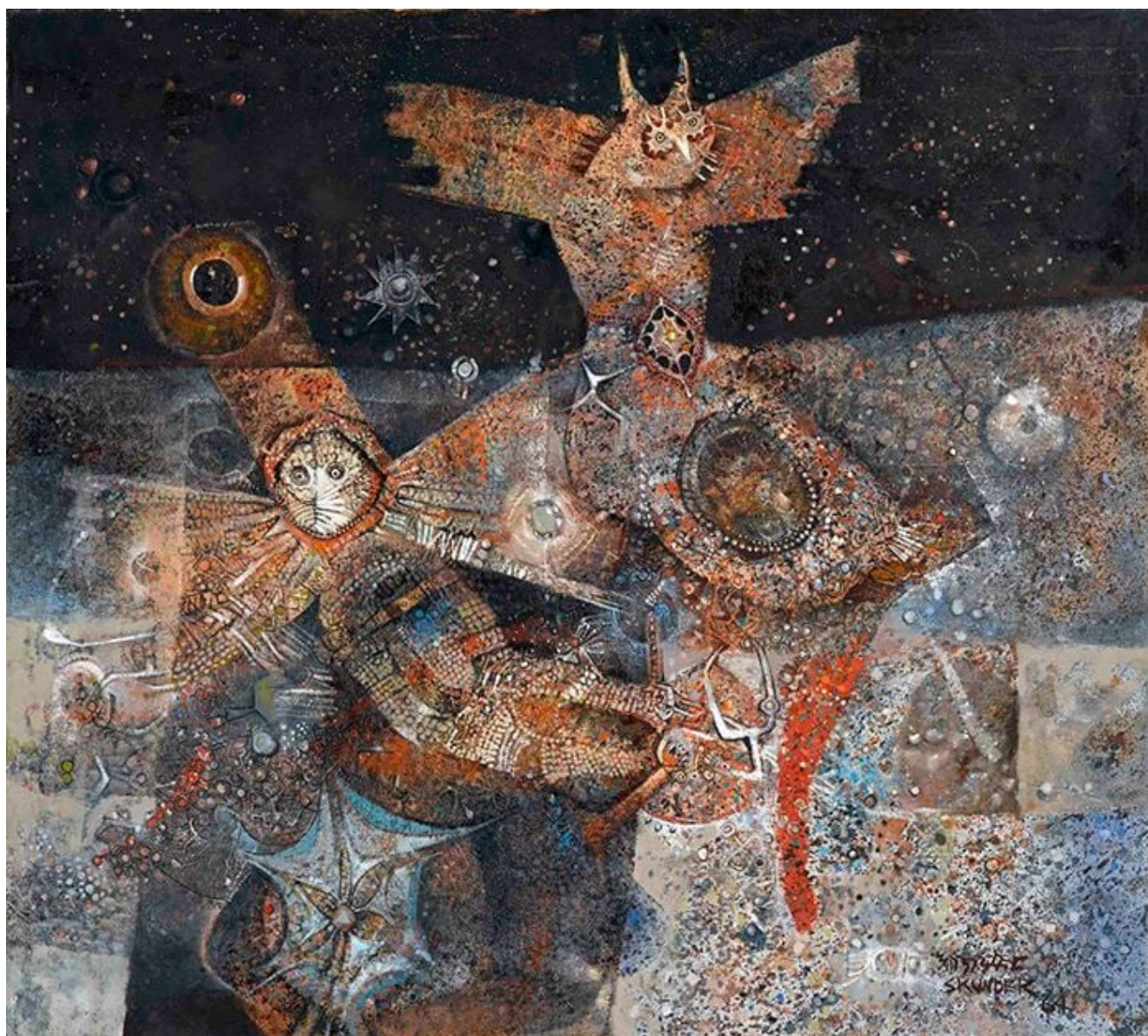
Night Flight of Dread and Delight , Skunder (Alexander) Boghossian, 1964