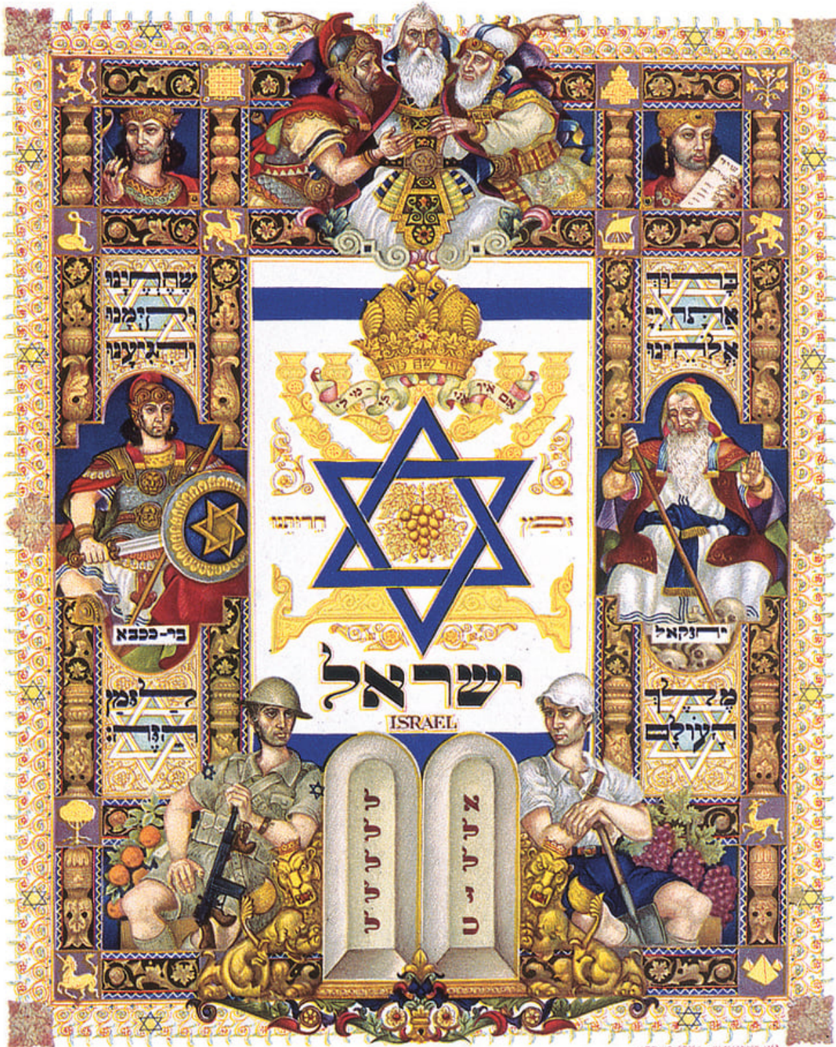
Visual History of Nations, Israel –Arthr Szyk, 1948