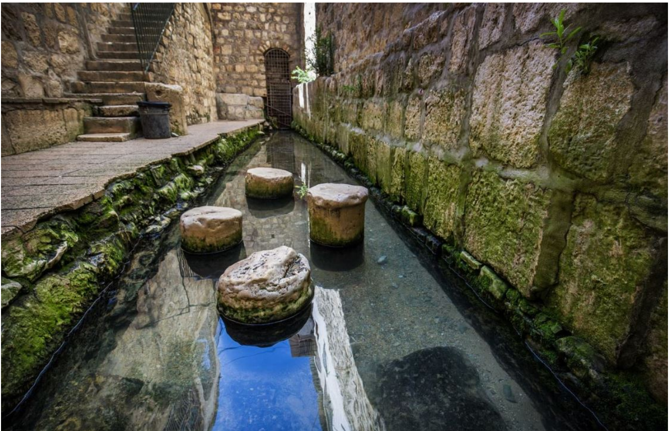
Hezekiah's Tunnel – Siloam Tunnel, Jerusalem