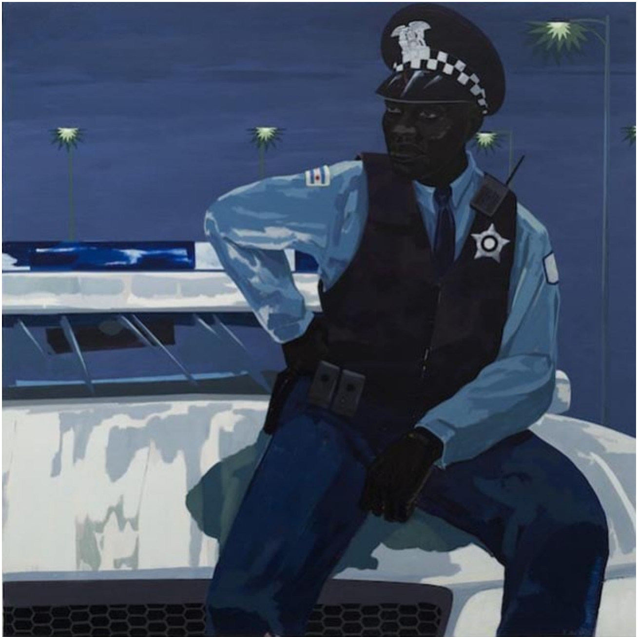
Untitled , Kerry James Marshall, 2015

Blue Bloods is the most successful American TV police/crime serial drama and has run continuously since December 4, 2010. In May, 2020, CBS renewed the series for an eleventh season