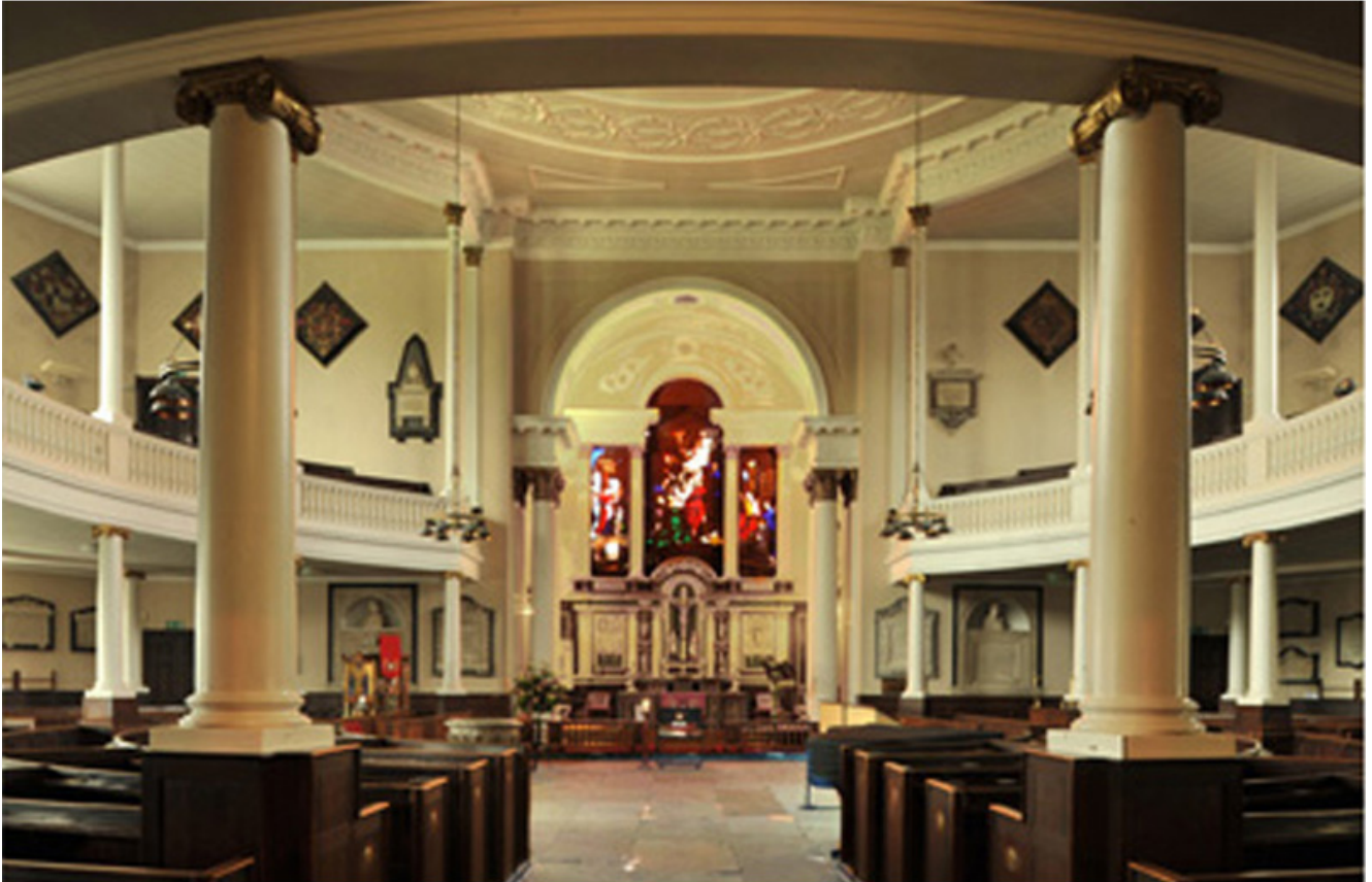
St Chad, Shrewsbury (George Steuart, 1790-2)