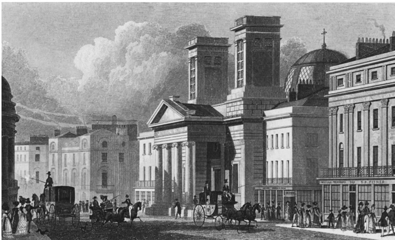
C. R. Cockerell's Hanover Chapel, Regent St., 1825 Thomas Hosmer Shepherd (from Metropolitan Improvements , p 315, by James Elmes, 1827)