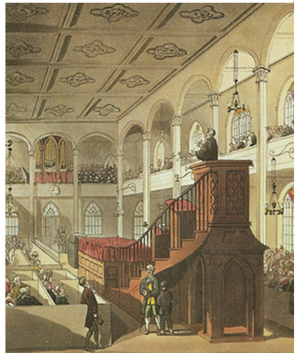
Left, St John, Doddington, Cheshire (Edward Lapidge, 1837) Right, The Philanthropic Chapel, London (James Peacock, 1803-6) showing a typical genteel congregation at worship, from Rudolph Ackermann's Microcosm of London, 1808-10.