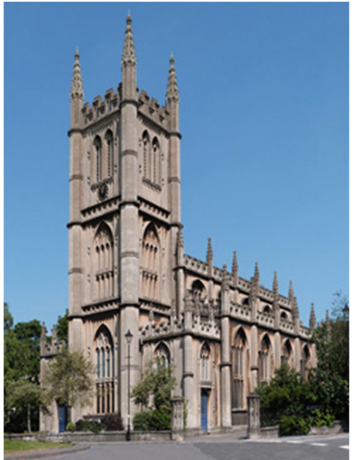
Left, Holy Trinity, Marylebone (John Soane, 1826-7) where the vestry wanted Gothic and reluctantly accepted a Classical alternative. Right, St Mary, Bathwick, Bath (John Pinch, erected 1817-29).

The period covered was a time of great anxiety and upheaval,