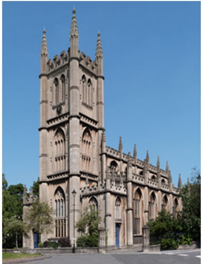
Left, Holy Trinity, Marylebone (John Soane, 1826-7) where the vestry wanted Gothic and reluctantly accepted a Classical alternative. Right, St Mary, Bathwick, Bath (John Pinch, erected 1817-29).

The period covered was a time of great anxiety and upheaval,