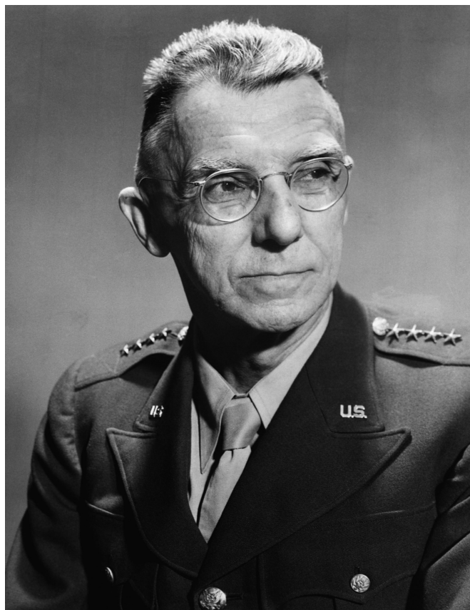
Vinegar Joe Stillwell

The former peace party is now the Pentagon war party. We are now beyond irony.