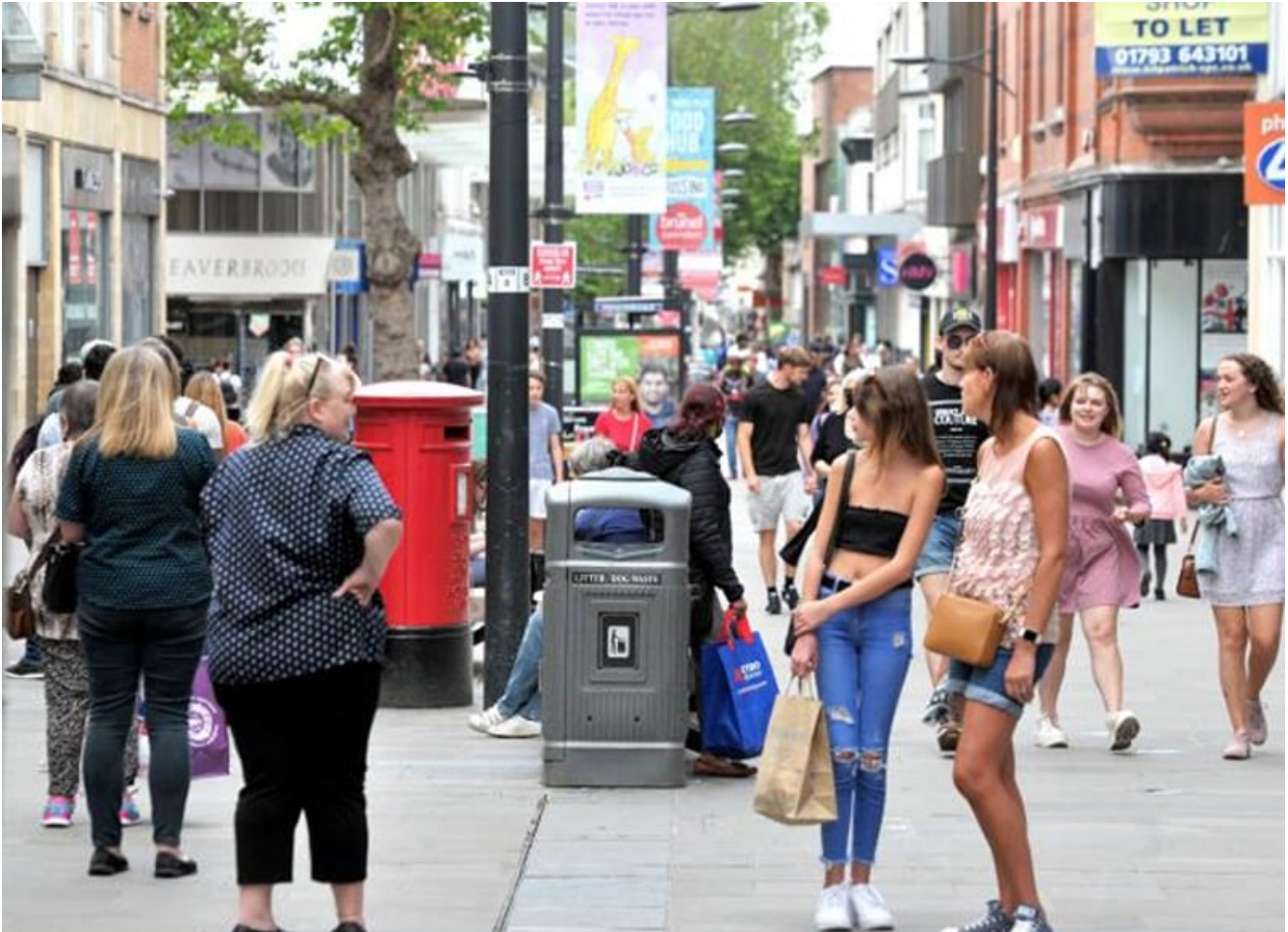
A busy day along a high street, the bright red letter box provides a recognizable landmark

Britain and America still differ in many ways that come to mind immediately, the direction of travel, Centigrade vs. Fahrenheit, Monarchy vs. Republic, Electoral systems. Another one that is apparent after more than a very brief stay is the contrasting postal systems and their visual imprint on the landscape.