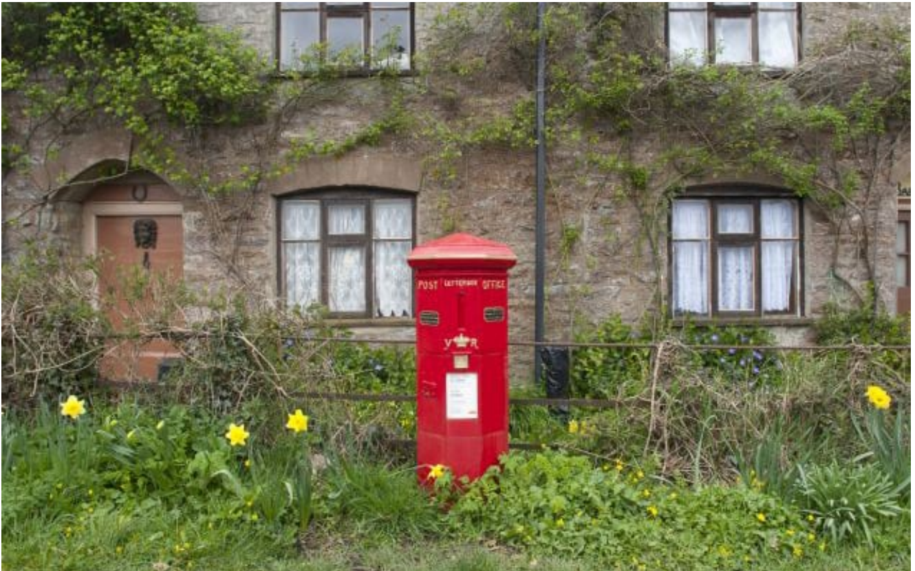
This letterbox in Dorset is the oldest in all of Britain at 168 years old.