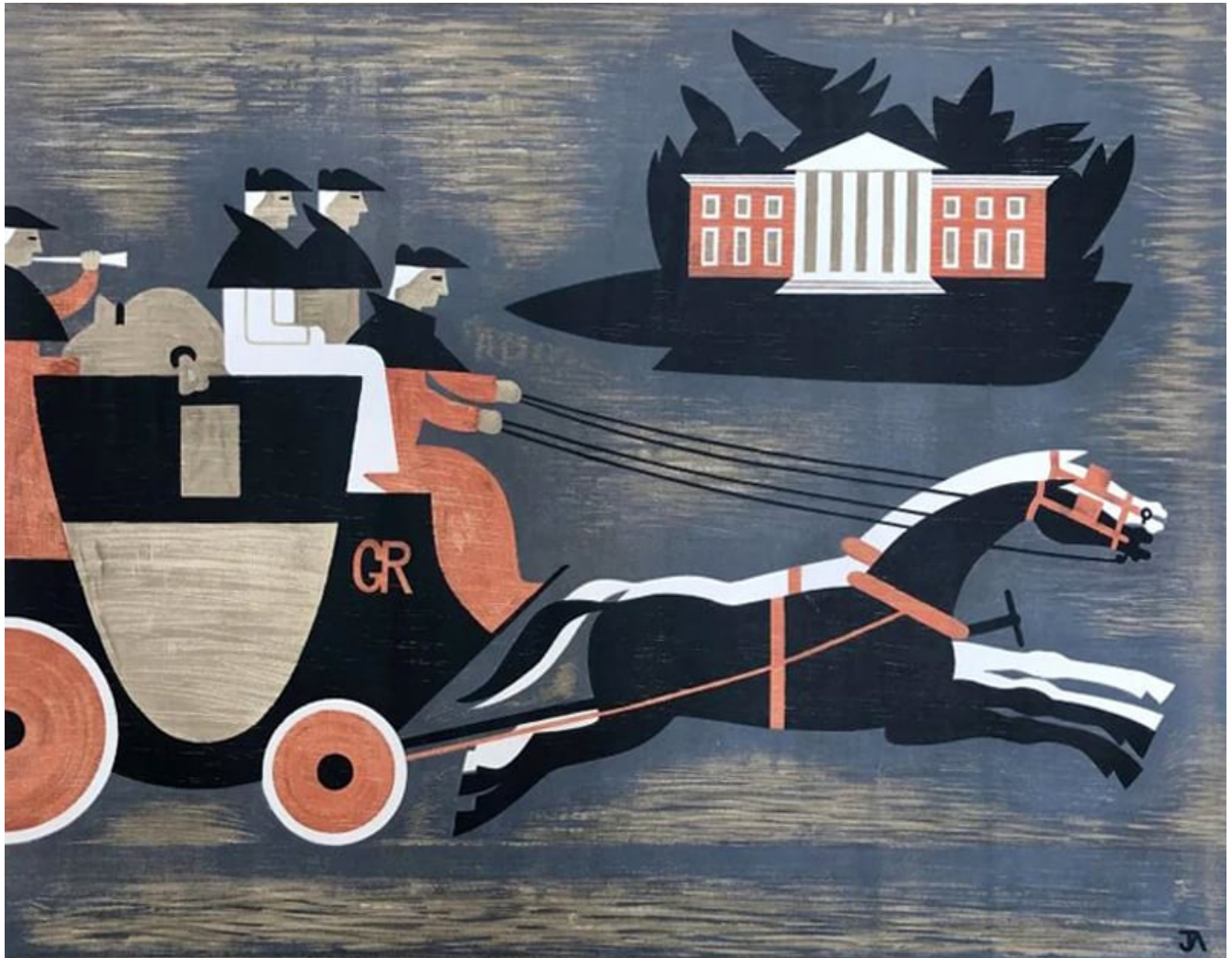
Royal Mail , John Armstrong, 1935

Visitors to Great Britain for the past three generations were immediately aware of two helpful, visible markers in the social geography of towns—the public telephone and the letter boxes. The former rapidly withered and ultimately disappeared, leaving few in the entire country due to the new technology of mobile phones. They exist today principally as memorabilia of