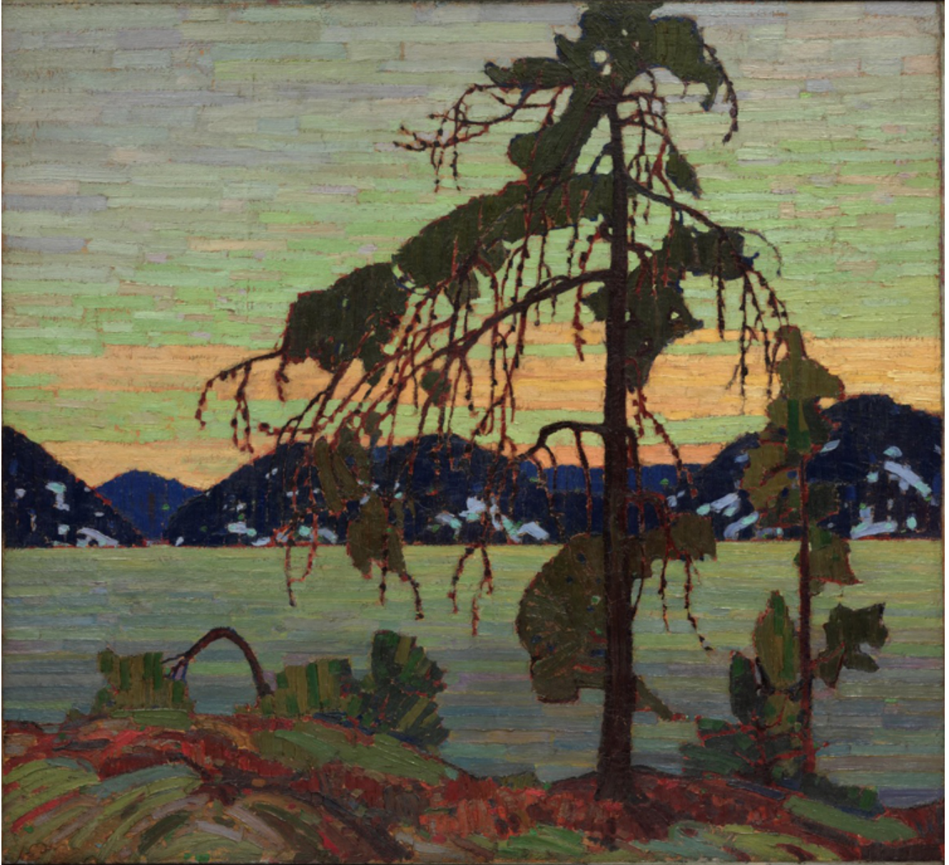
The Jack Pine , Tom Thomson, 1916