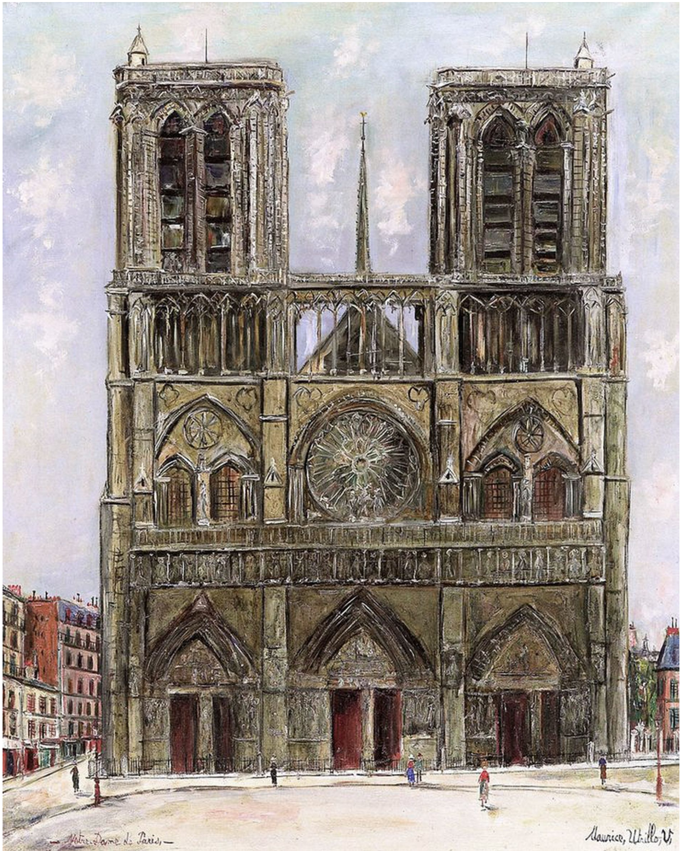
Notre-Dame de Paris , Maurice Utrillo, 1929

These two venerated shrines, both recently cited in the news, have been the objects of intended and de facto cultural