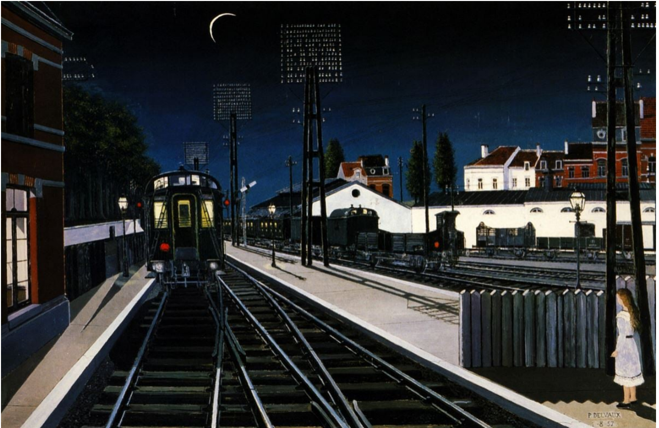
Trains du Soir , Paul Delvaux, 1957

Everything's changing, they say. But it isn't true. Nothing has really changed. They just go on being impressed by themselves and that's all. Which isn't new, either. A few words have changed—but not many of them, even. Two or three little ones here and there... —Céline, Journey to the End of the Night