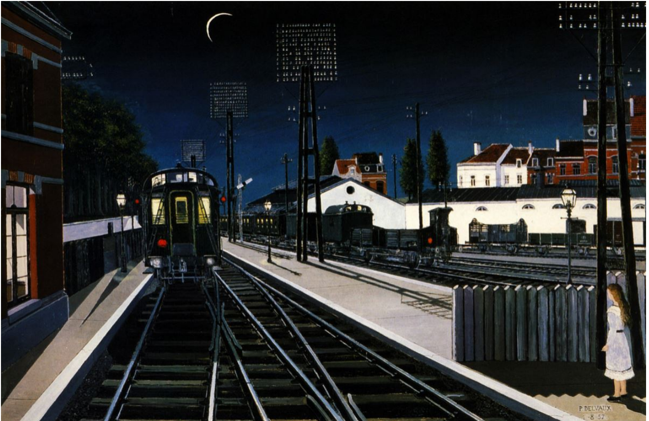
Trains du Soir , Paul Delvaux, 1957

Everything's changing, they say. But it isn't true. Nothing has really changed. They just go on being impressed by themselves and that's all. Which isn't new, either. A few words have changed—but not many of them, even. Two or three little ones here and there... —Céline, Journey to the End of the Night