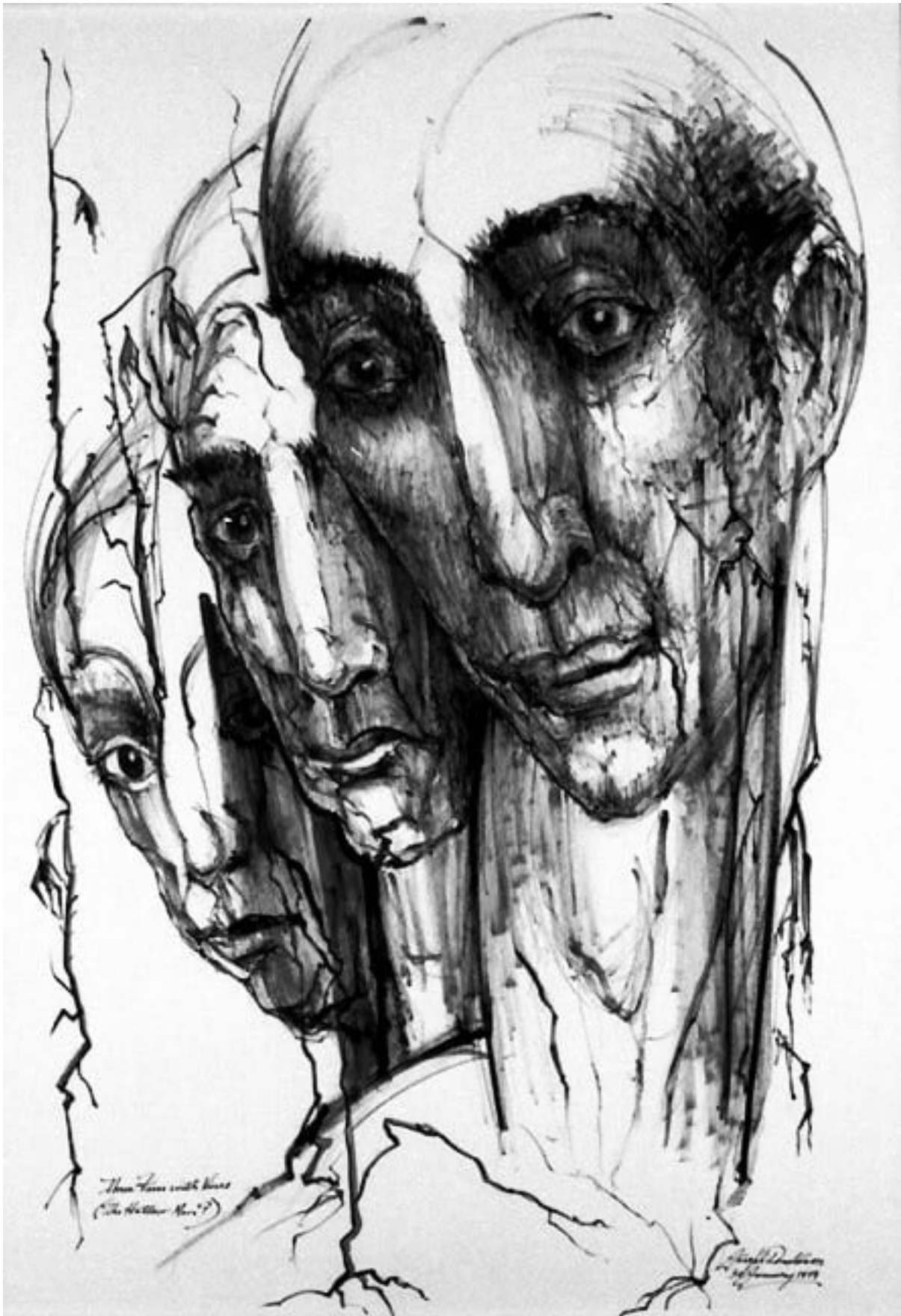
Three Faces with Venus (The Hollow Men?) , Joseph Donaldson, 1979