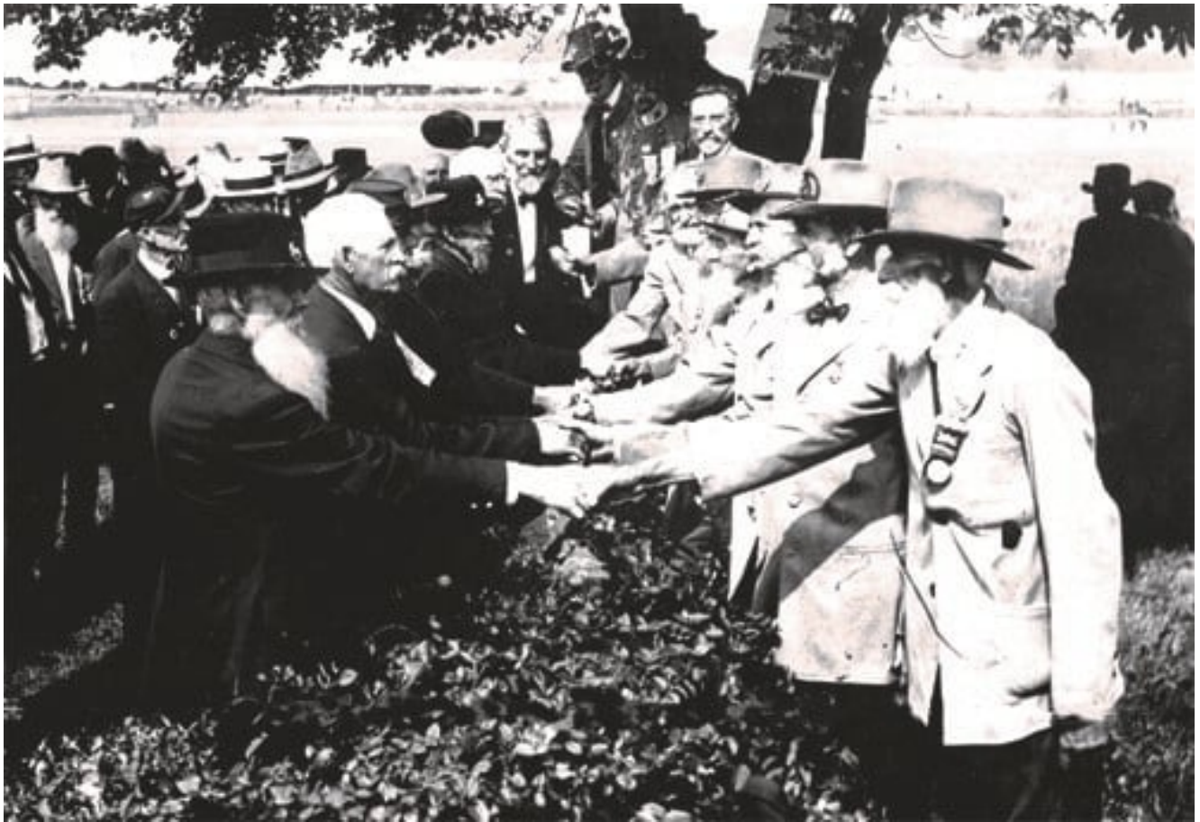
America Unified: 50th Anniversary, Battle of Gettysburg, Union and Confederate Veterans Greet Each Other at the Scene of Pickett's Charge, 1913.