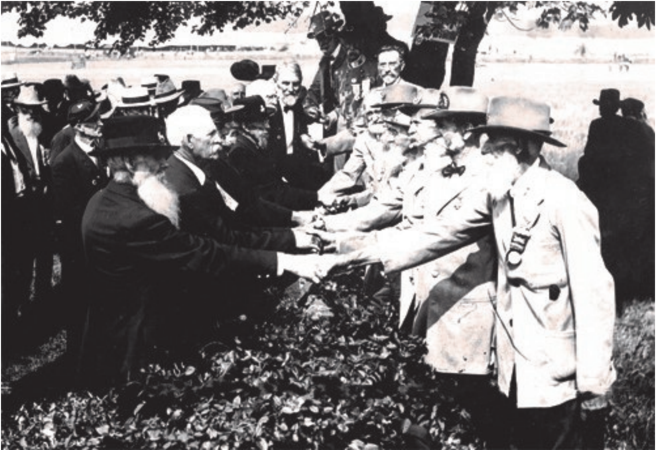
America Unified: 50th Anniversary, Battle of Gettysburg, Union and Confederate Veterans Greet Each Other at the Scene of Pickett's Charge, 1913.