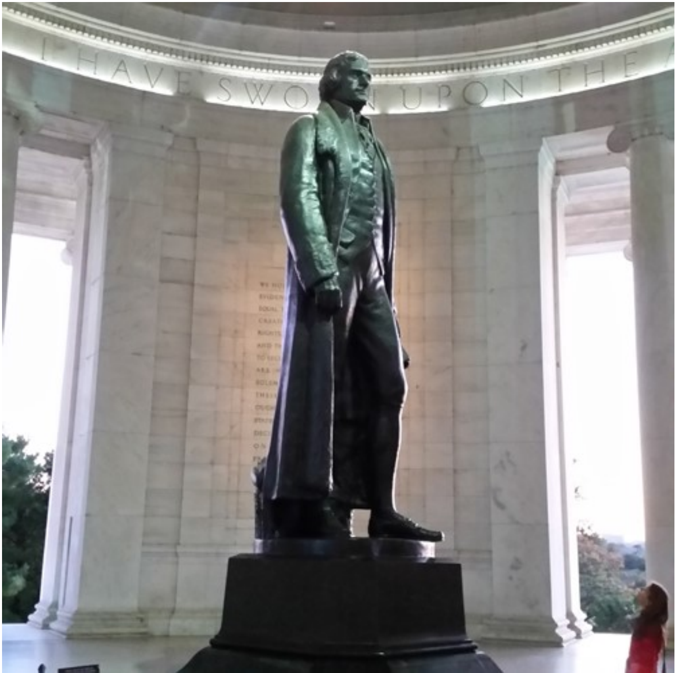
Jefferson Memorial, Washington, DC