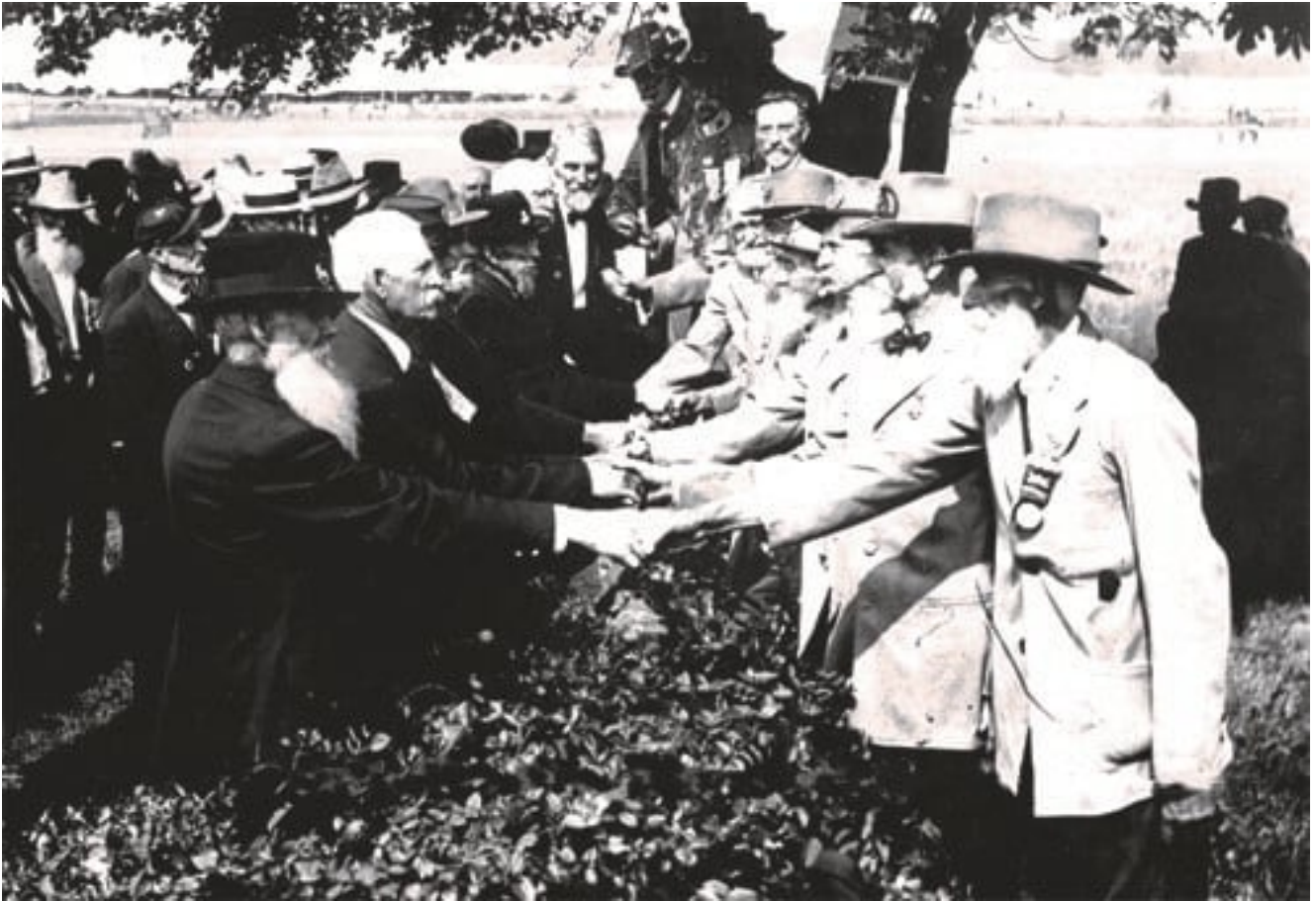
America Unified: 50th Anniversary, Battle of Gettysburg, Union and Confederate Veterans Greet Each Other at the Scene of Pickett's Charge, 1913.