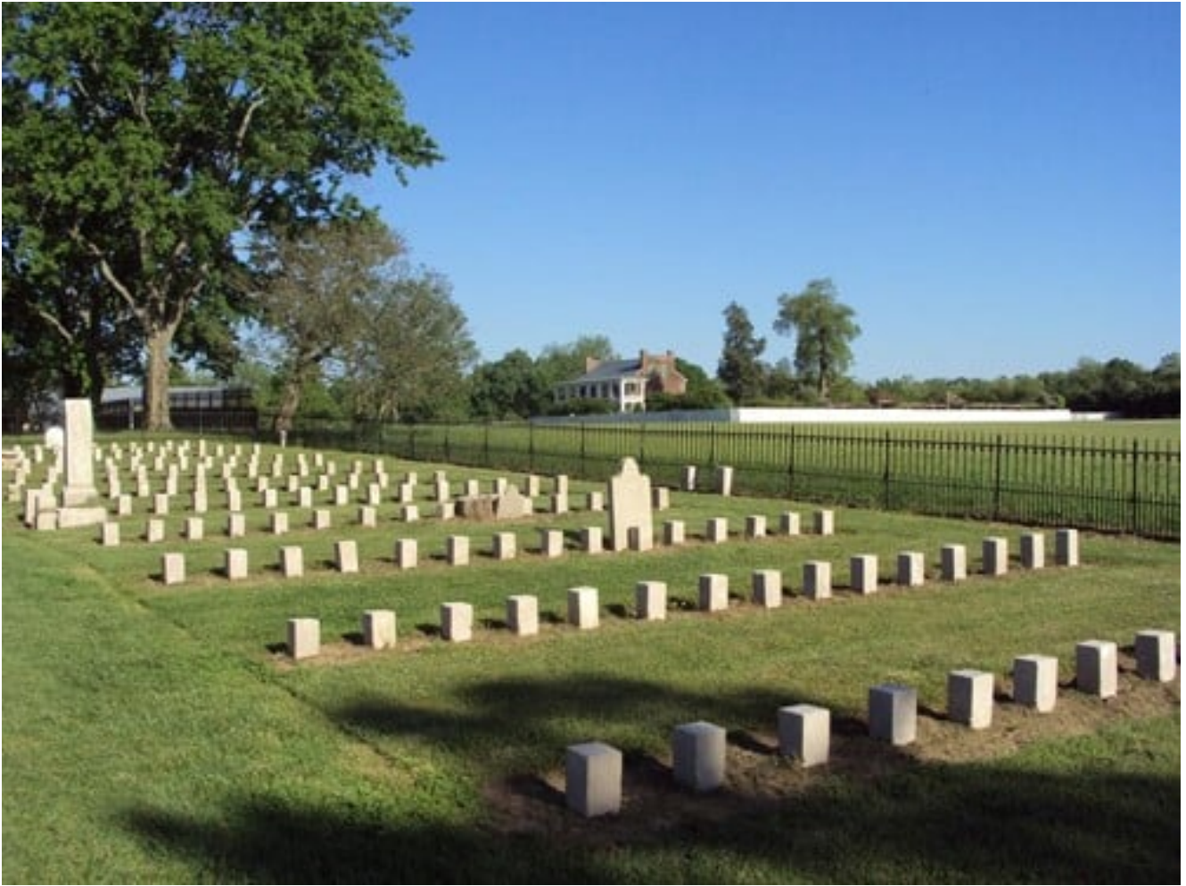
Battle of Franklin, TN (November 30, 1864), Confederate Cemetery, Carnton, Franklin, TN.