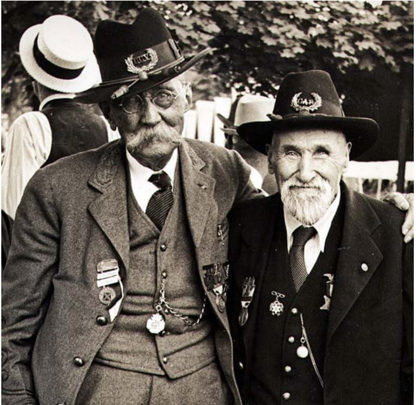
75th Gettysburg reunion, Union and Confederate veterans, 1938