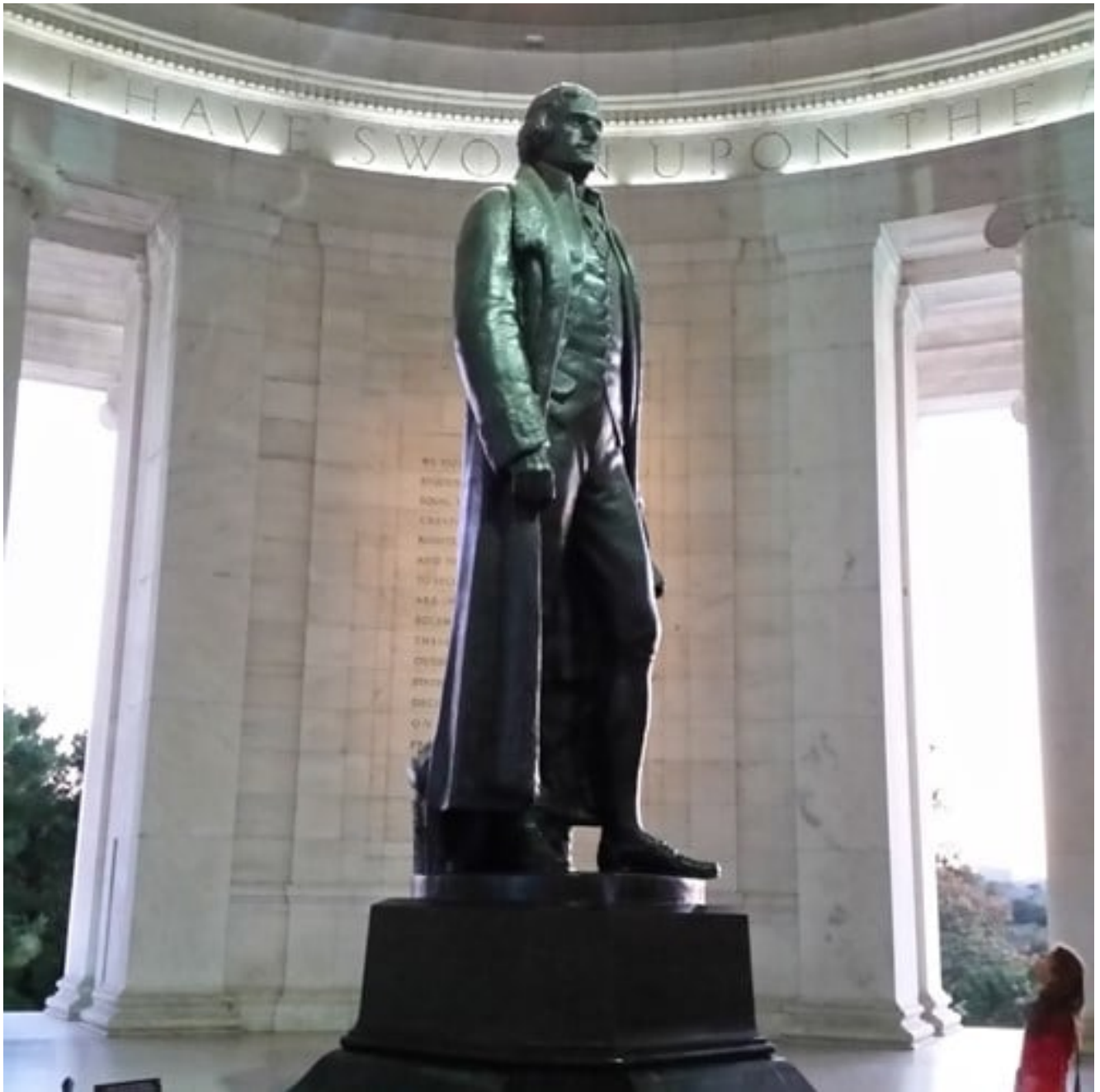
Jefferson Memorial, Washington, DC