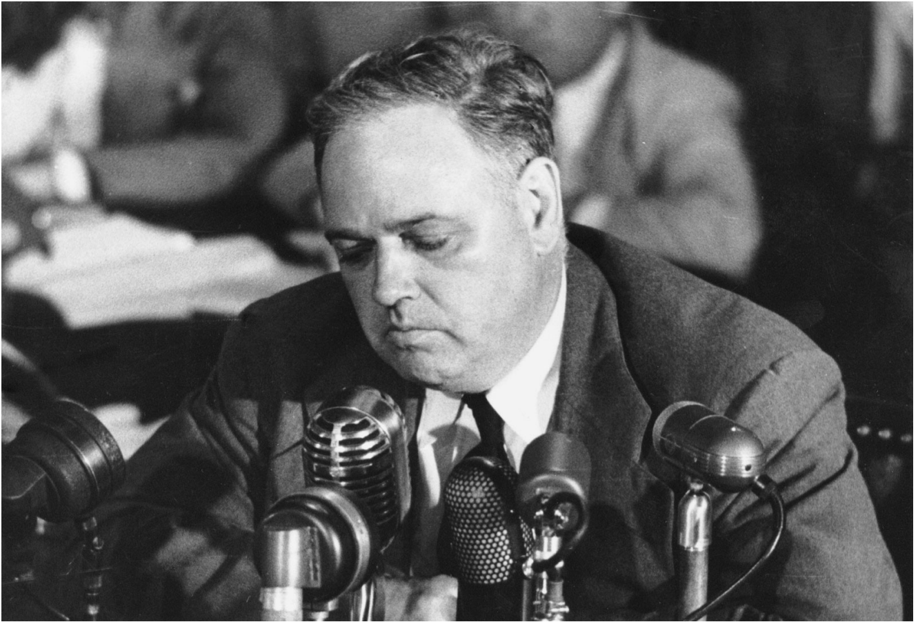
Whittaker Chambers Testifies Against Alger Hiss, 1948