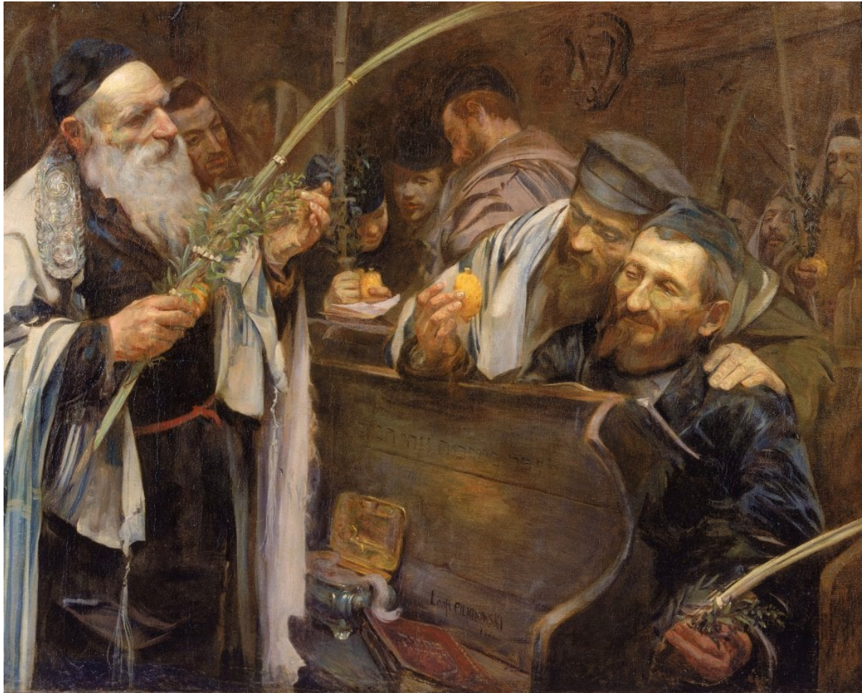
Celebrating Sukkoth inside the Sukkah