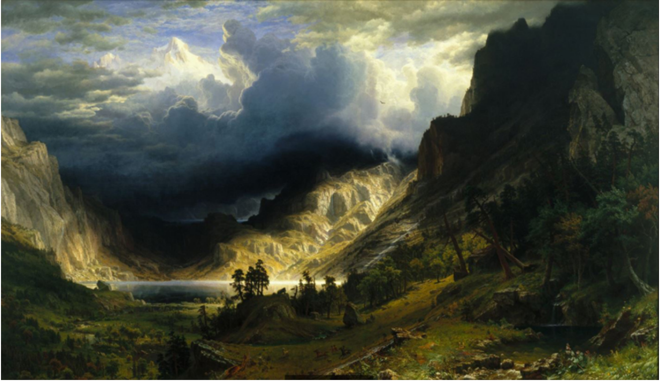
A Storm in the Rocky Mountains, Mt. Rosalie, Albert Bierstadt, 1866

Adapted from Chapter 1 of The Mountain and the River: Genesis, Postmodernism, and the Machine, published by New English Review Press, June, 2023.