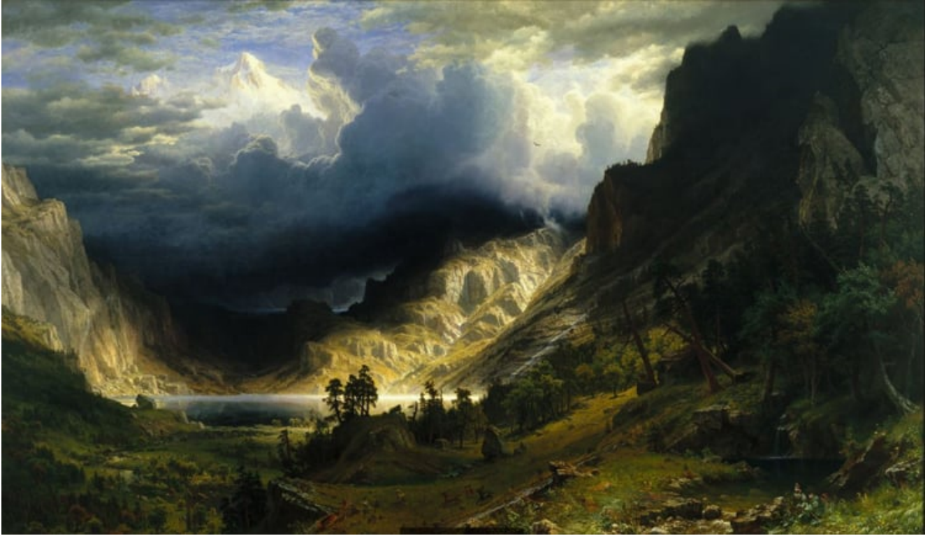
A Storm in the Rocky Mountains, Mt. Rosalie, Albert Bierstadt, 1866

Adapted from Chapter 1 of The Mountain and the River: Genesis, Postmodernism, and the Machine, published by New English Review Press, June, 2023.