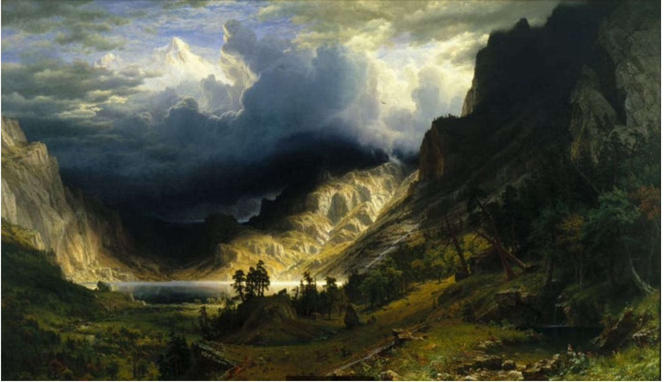
A Storm in the Rocky Mountains, Mt. Rosalie , Albert Bierstadt, 1866

Adapted from Chapter 1 of The Mountain and the River: Genesis, Postmodernism, and the Machine, published by New English Review Press, June, 2023.