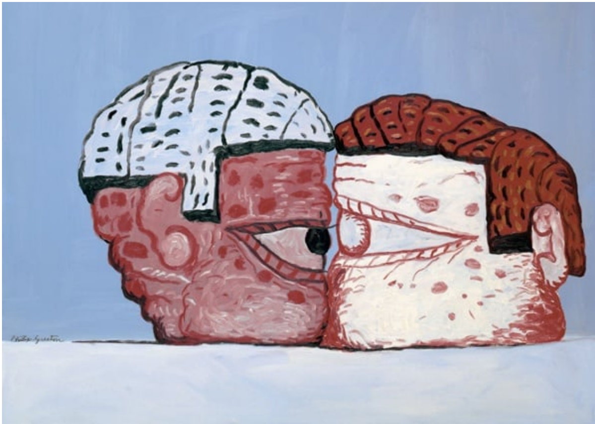
Aggressor , Philip Guston, 1978

There are two ways to be fooled. One is to believe what isn't true; the other is to refuse to believe what is true. –Kierkegaard