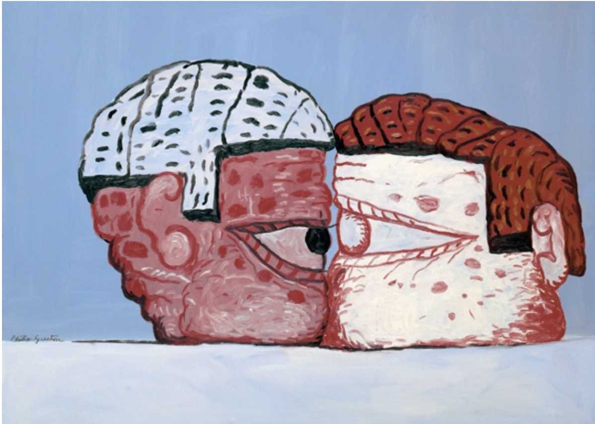
Aggressor , Philip Guston, 1978

There are two ways to be fooled. One is to believe what isn't true; the other is to refuse to believe what is true. –Kierkegaard