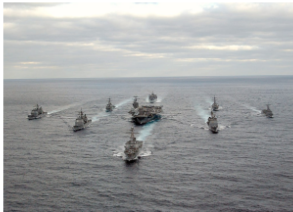
USS George Washington Carrier Battle Group