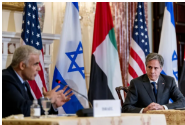
Israel Foreign Minister Yair Lapid and US Secretary of State Antony Blinken