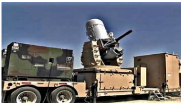
Picture of C-RAM anti-drone system

and the electronics which are made in China. They usually use a single cylinder or a two-cylinder engine. These Chinese engines cost anywhere from $400 to $1,000 which is still cheap, from a weapons point of view. Electronics are dirt cheap, and they put a camera and explosive package in them and off they go.