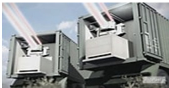
Israeli Iron Beam system

They also have missiles that they can use, but it is expensive to fire a $50,000 missile at a $20 drone. It is not cost-effective. That is why everyone is looking for other practical solutions, lasers being one of them, jamming is another, nets that we have discussed, even single shot guns that can identify the drone and nail it. However, it is still short range. In fact, there has been even talk about using hawks and other birds to peck at the drone or grab a drone with their talons and fly off. But no, it is not the best solution. High-powered microwave and lasers are most promising.