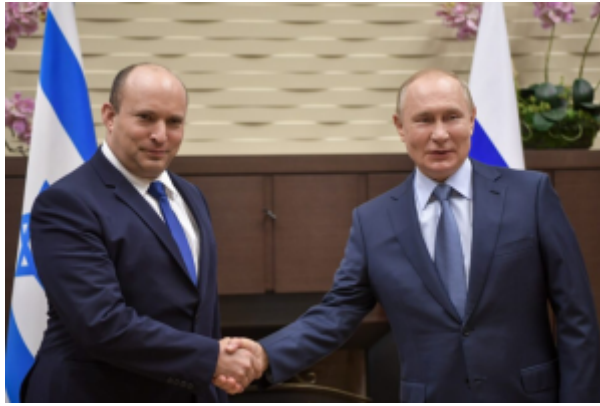
Israel Prime Minister Naftali Bennett with Russia President Vladimir Putin, Moscow, January 13, 2022