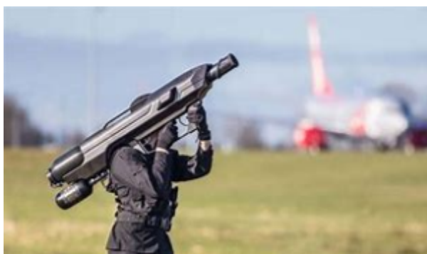
Handheld Jammer for Small Drones

It is a cheap Chinese quadcopter. They are commercially available. There are millions of them. When I say cheap, I mean $200 or less. It was sent to spy on Israel. Interesting thing is that it had a memory chip in it, and the memory chip had all the video that the drone was making, and the Israelis got it. What is amusing was when the Hezbollah operatives were, getting this thing ready to launch, the camera inside the drone was taking pictures of the team operating it. In the picture, you can see the operator holding the drone controller that you could buy in any hobby shop. There was nothing special about it. It just had a camera, and it had a memory card in it. The larger commercial quadcopters can be retrofitted with explosives, for example, a grenade or shell sent over, trying to kill people with it. We have seen that coming out of Gaza. We have seen that coming out of Syria aimed at the Russians, and we have also seen it in Iraq attacking US troops.