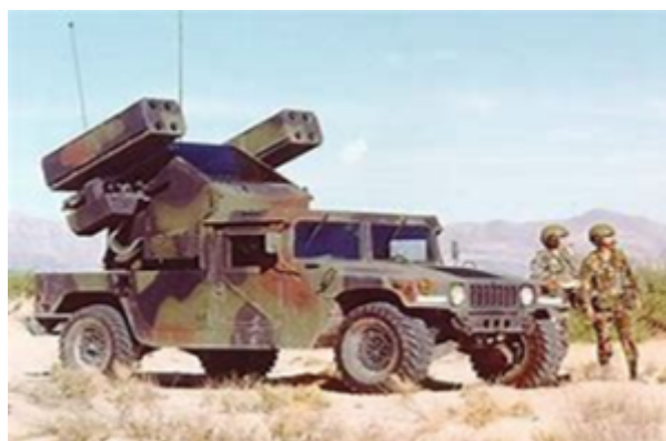
US Army Avenger Stinger Missile System

The US Army especially is resisting trying to use these kinds of techniques. Look at the Al Assad base in Iraq that was recently hit three days in a row. They did not have jammers. They did not have lasers, other than a missile they used and the C-RAM gun, which they used. They could have done better, but they did not.