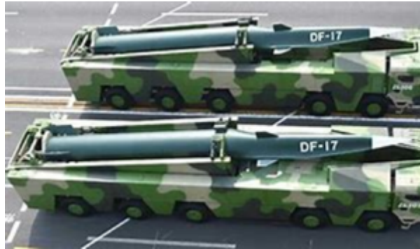
Chinese Mobile "Hypersonic" DF-17 Missiles