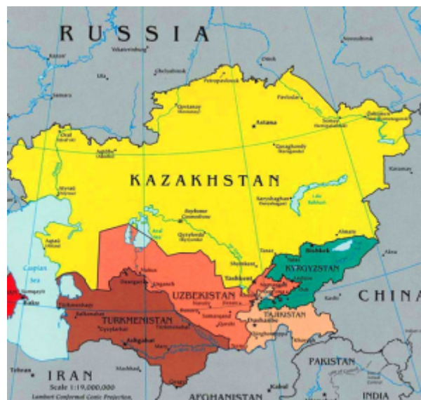
Russia, US Interests in Kazakhstan