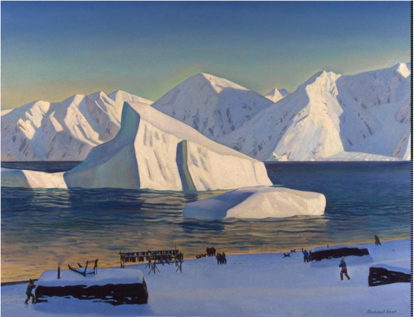
Early November, North Greenland (Kent Rockwell, 1935)

As recently as the outbreak of World War II, the Danish Realm consisted of four distinct segments: Denmark proper (the peninsular of Jutland located on the mainland of Europe and sharing borders with Germany and two major islands, Zealand, and Fünen), and three outlying island regions with major geographic barriers separating them from Denmark proper and