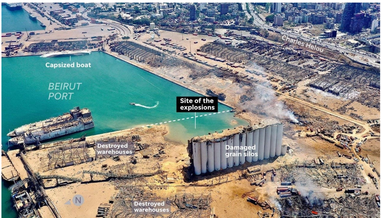
Beirut Port Damage