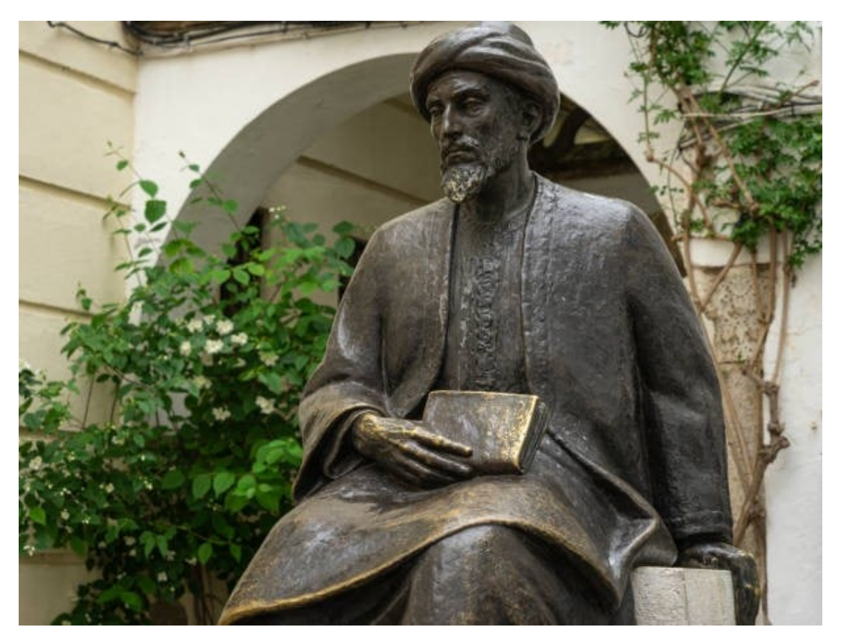
Statue of Rabbi Moses Maimonides in his birthplace, Cordoba, Spain

If you travel from the port of Haifa up into the hills you will inevitably come across the Bahai Temple, a splendid neo-Islamic structure with magnificent gardens open to the public. Standing on the marble steps of the shrine of the founder of this religion you look out at the port and the endless horizon of the Mediterranean Sea.