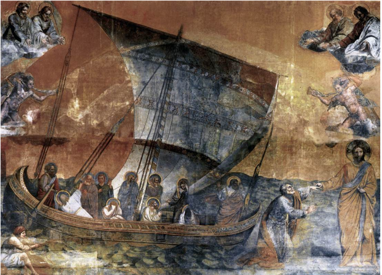
After Giotto's Navicella, Francesco Berretta, 1628

The only attractive thing about Eugenio Pacelli, Pope Pius the 12 th , was his habit of dining. Pius dined alone, except for his cage of canaries. Pius would open the cage so that the birds exited, flew about and joined him at the table. When through with his repast, the Pope would extend his hand so that each bird would alight upon a finger and allow itself to be returned to the cage.