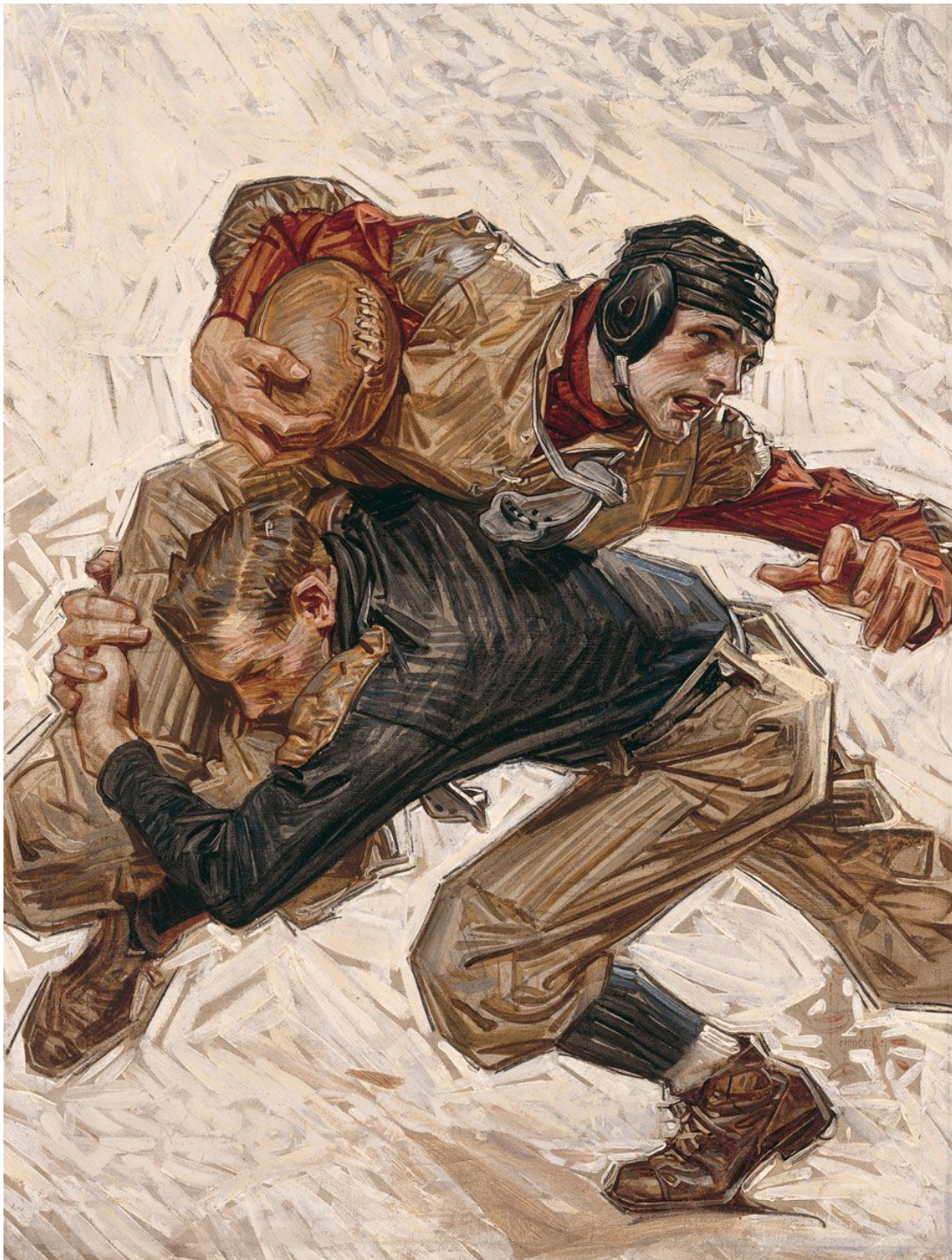
Football Players , J.C. Leyendecker, 1909