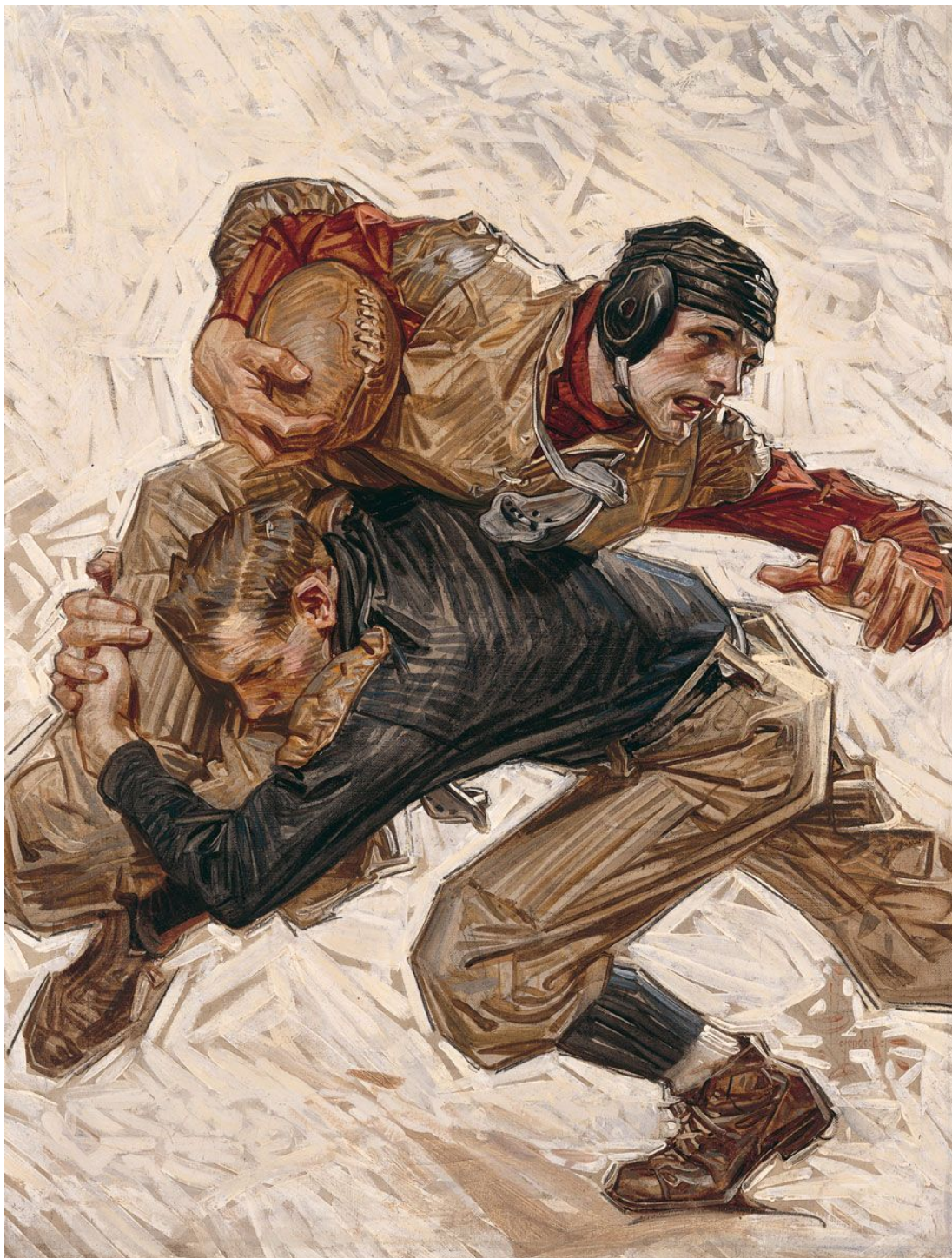
Football Players , J.C. Leyendecker, 1909