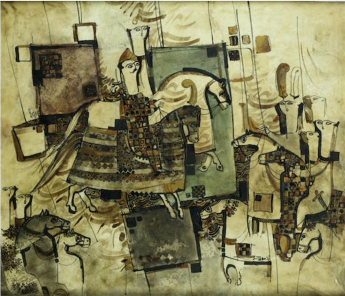
Untitled, Sadegh Tabrizi

In 1971, Israeli political scientist Yehezkel Dror identified ideologically-aggressive nations in pursuit of irrational or counter-rational goals as " crazy states ." Impulsive decision-