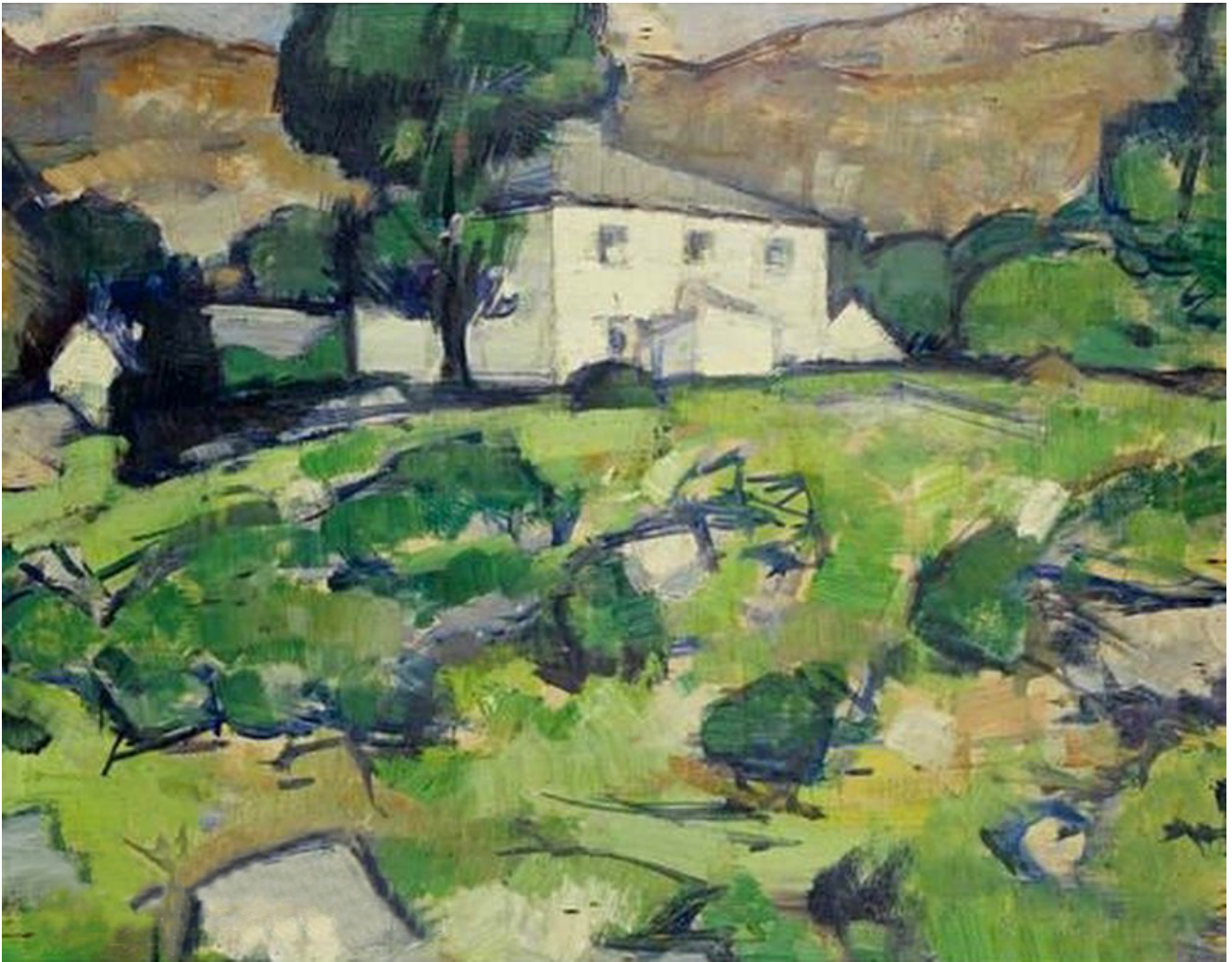
The White Farm , Samuel Peploe, 20th c

This is an extended version of an article recently published in The Jackdaw, No 165.