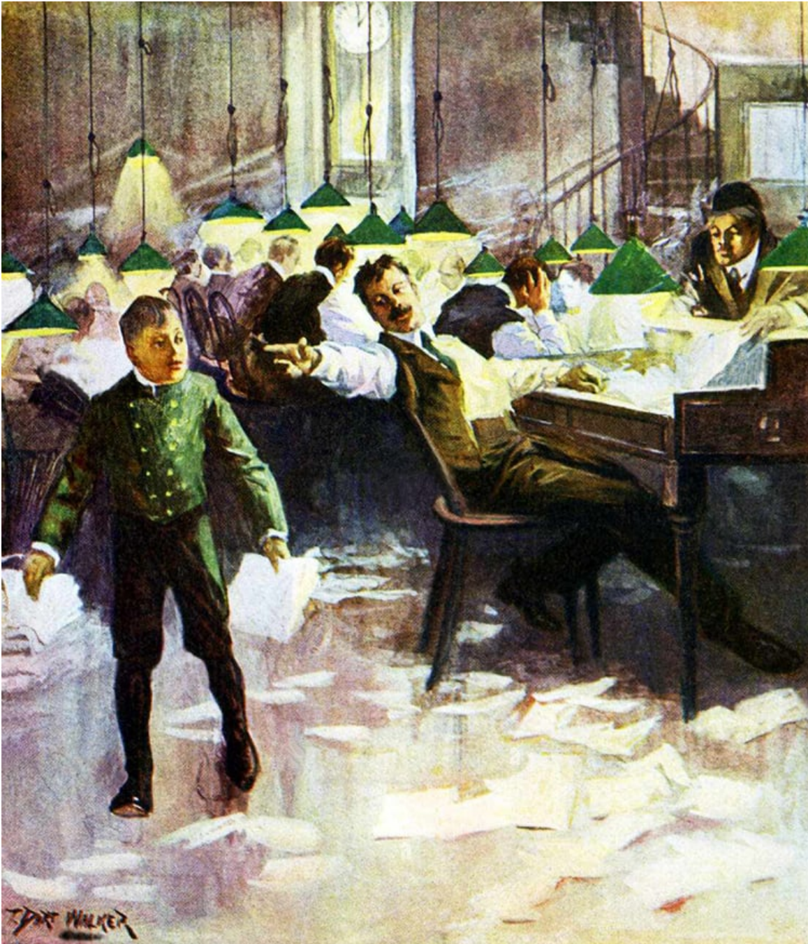
The Newsroom (T. Dart Walker, 1903)

Journalism operates within a simple binary, a distinction G.K.