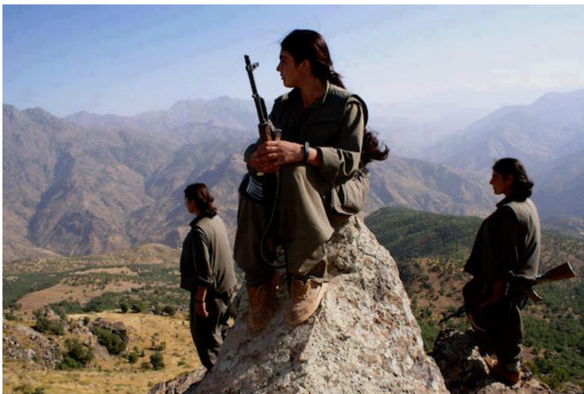
Kurdish Freedom Fighters, 2008