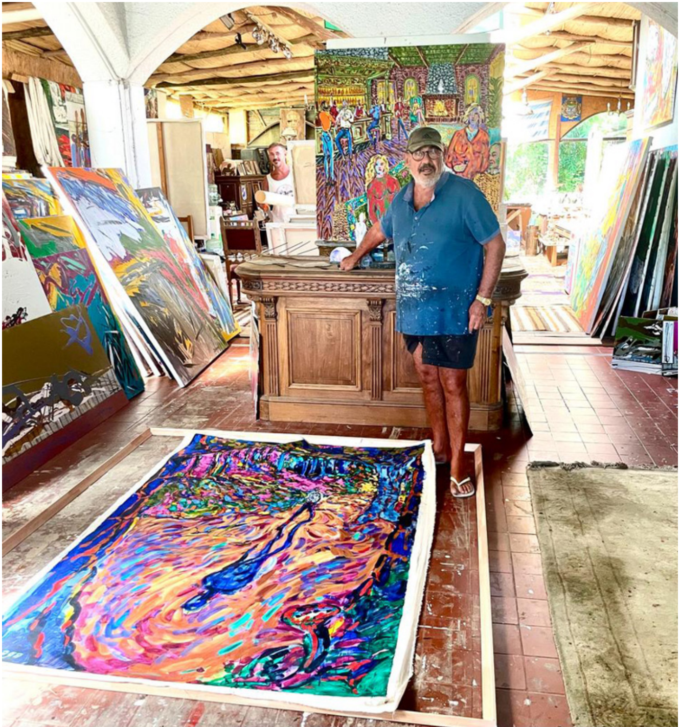
Ignacio Zuloaga standing next to his painting "Hombre perdido en un bosque (Man lost in a forest)"