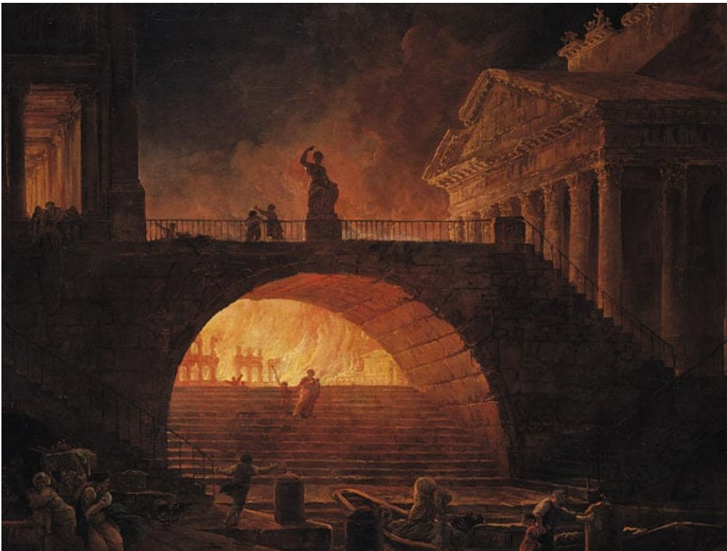
Fire of Rome, Hubert Robert, 1771

“the problems of violence and inhumanity that faced the world at the time of Christ’s birth still exist in such areas as Vietnam”