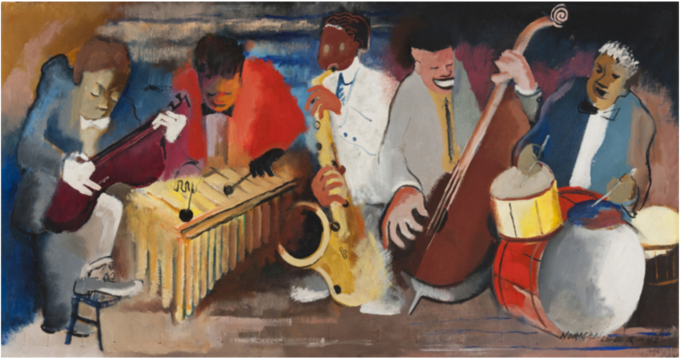
Jumping Jive , Norman Lewis, 1942

Never, for the sake of peace and quiet, deny your own experience or convictions.—Dag Hammarskjöld