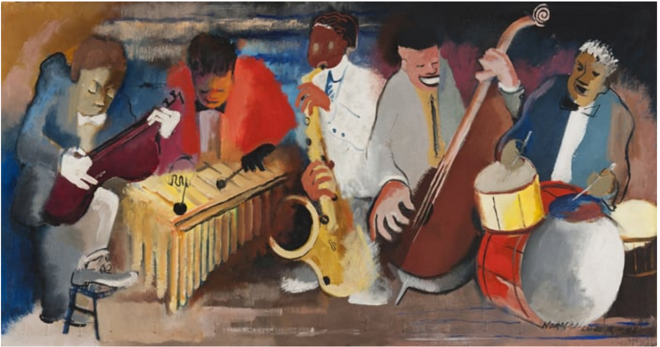
Jumping Jive , Norman Lewis, 1942

Never, for the sake of peace and quiet, deny your own experience or convictions.—Dag Hammarskjöld