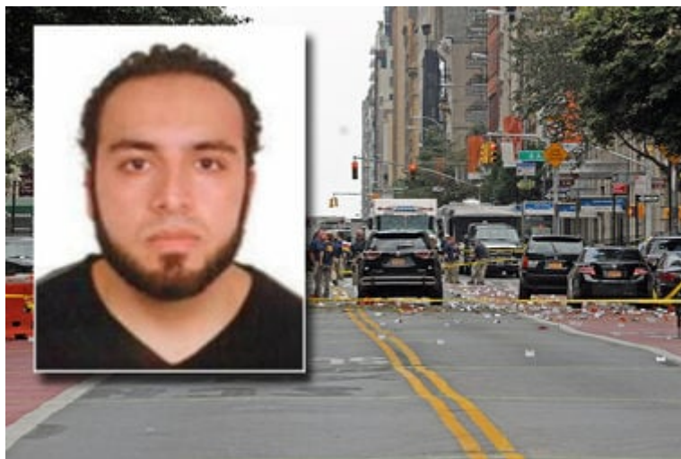
New Jersey Terrorist Bomber and Manhattan Bombing Site