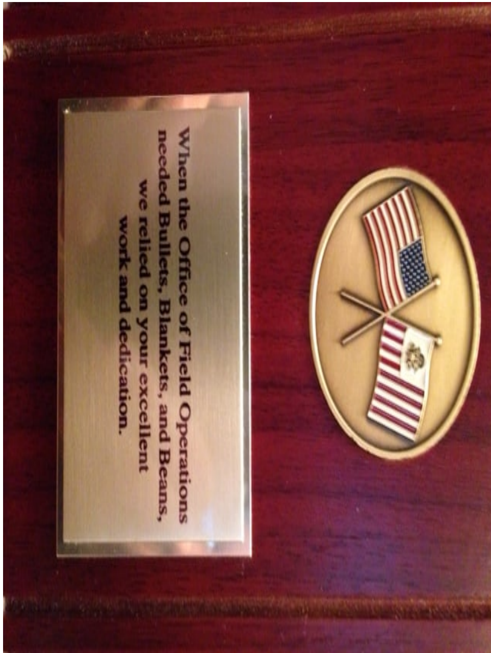
Customs Field Operations Citation given to Agent X