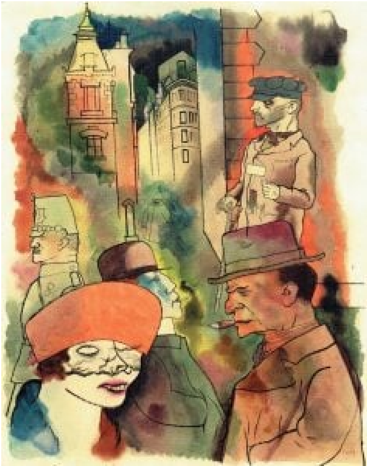
Dämmerung (from Ecce Homo ), George Grosz, 1922

Trannies need us to play along or the entire illusion