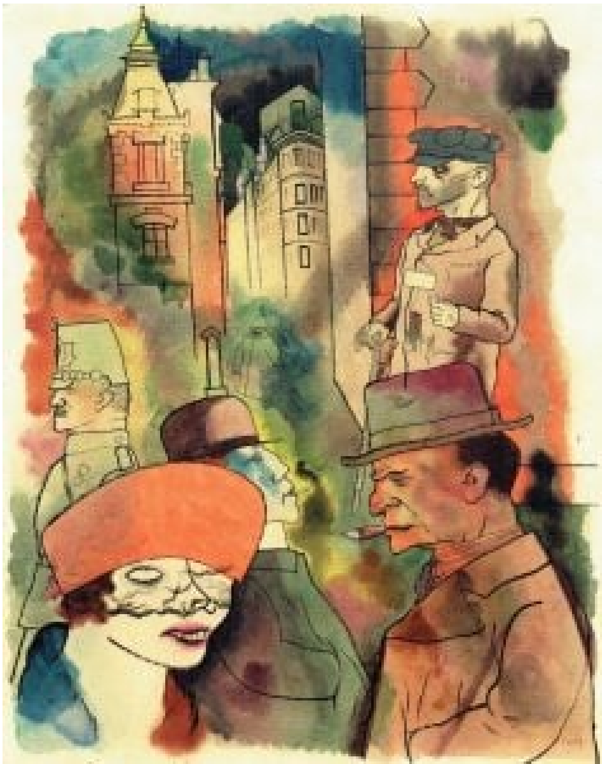
Dämmerung (from Ecce Homo ), George Grosz, 1922

Trannies need us to play along or the entire illusion