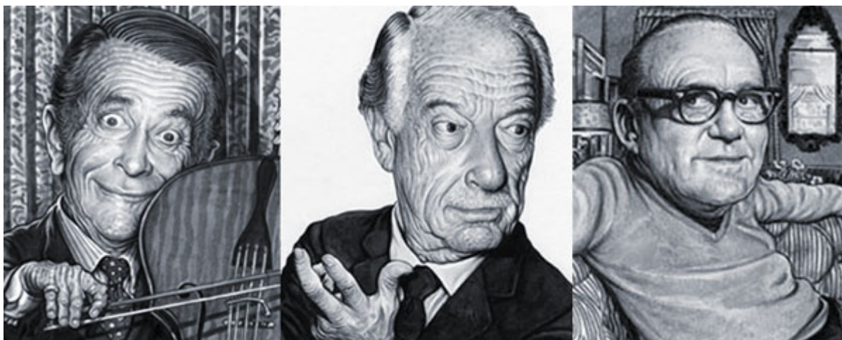
Morey Amsterdam, Victor Borge, and Jack Benny portraits by Drew Friedman

. . . the structure of [Aby Warburg's] Nachleben is close to that of the Freudian symptom, being not only the afterimage of an old thought that troubles new perceptions, but the phantasmal re-staging of an original traumatic scene . . . the Urszene —that may not have taken place at all (and whose actuality in any case is irrelevant) The Freudian symptomology eschews the distinction between original trauma and later re-elaboration . . . [1]