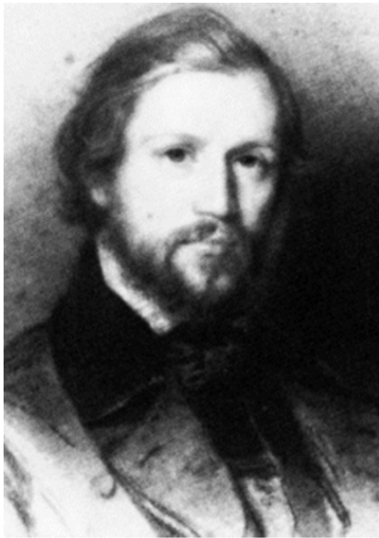
Charles Valentin Alkan

ideologues created in the early twentieth century, but the animus was building up in France throughout Alkan's lifetime; and it would climax in the 1890s with the Dreyfus Affair. Innuendo, rumour and other