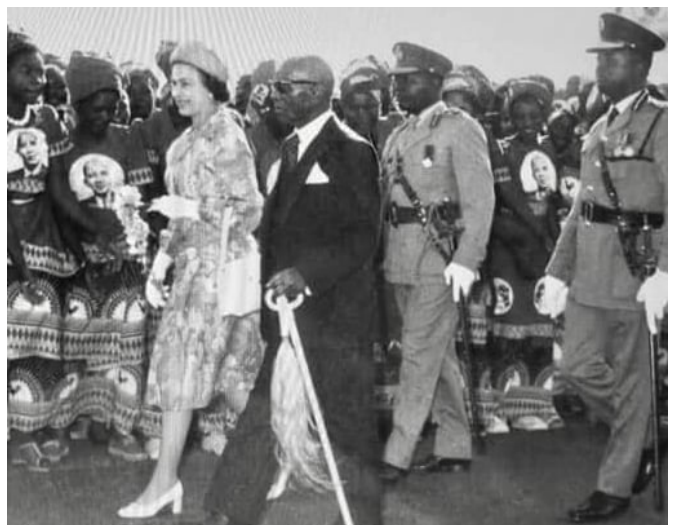
Ngwazi Dr H Kamuzu Banda with Queen Elizabeth II, 1979

a satire on the absurdity of the question, took it very seriously. More recently, visitors have been asked whether they have ever been involved in genocidal activities or intended to become so in the future, the desired answer to which question was not very difficult to guess. And six months after the attacks on the World Trade Center in New York on 11 September, 2001, I received an official form in the prison in England in which I worked as a doctor—a copy of which I wish now I had also kept—asking me whether I had ever been a terrorist or intended to become one in the future: and I was warned that if I did not reply to these questions, presumably with the right answers, I would be sacked. What struck me most forcefully about this idiocy was that it was not spontaneously generated, that there must have been persons paid from the public purse to devise such questions, persons who probably considered that they were very hard-working and even overworked.)