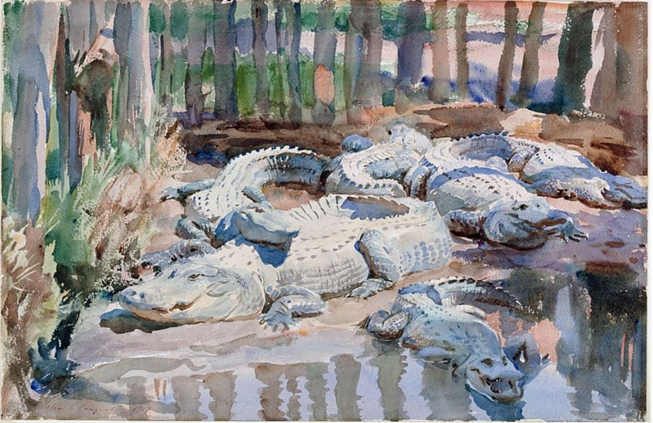
Muddy Alligators , John Singer Sargent, 1917

I cannot say when the importance of the preservation of present ephemera for the sake of future understanding of the past first struck me. For long, it did not occur to me that a great deal might in the future be deduced about the past by a person of imagination from a document unworthy of preservation from a purely literary or intellectual point of view.