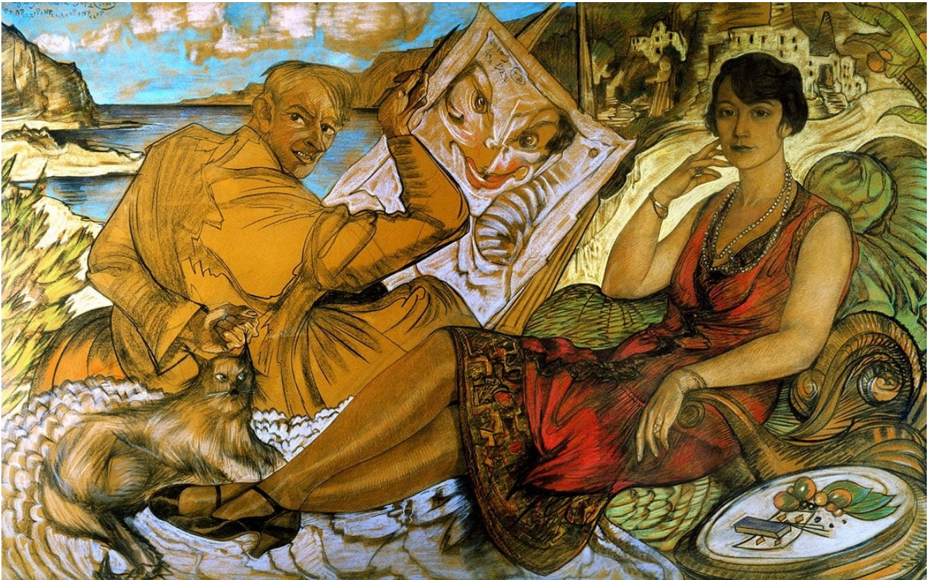
Falsehood of a Woman , Stanisław Ignacy Witkiewicz, 1927

The mystery of one's birth and the inconceivability of the world's existence without the positing of one's ego were the only luminous points in a series of otherwise obscure moments. [1] –Witkiewicz